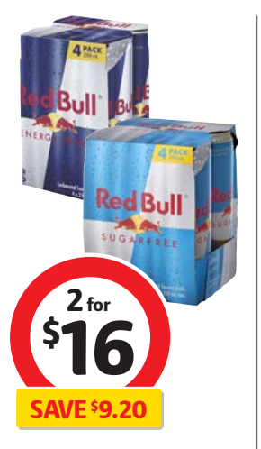
Red Bull Energy Drink 4x250mL $8.00 per litre