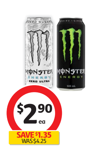
Monster Energy Drink 500mL $5.80 per litre