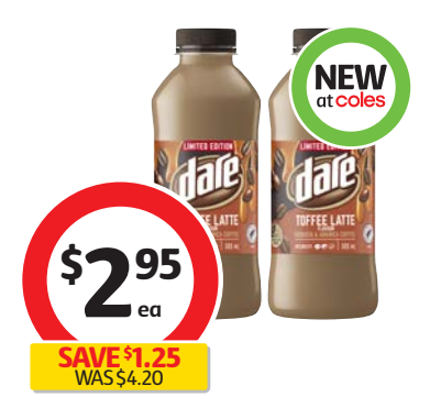
Dare Flavoured Milk 500mL $5.90 per litre