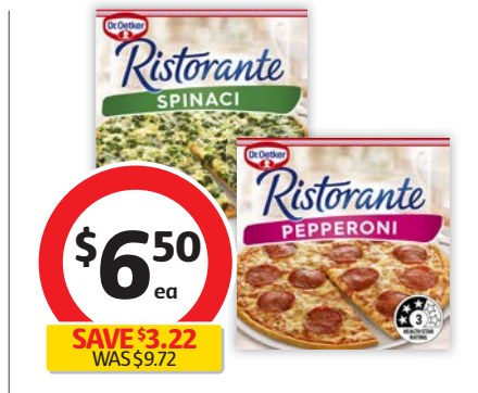
Dr Oetker Ristorante Pizza 310g-390g