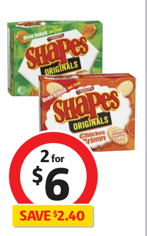
Arnott's Shapes Crackers 130g-190g 2nd week on sale