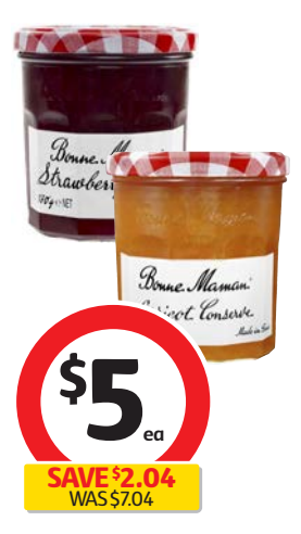
Bonne Maman Conserve 370g $1.35 per 100g