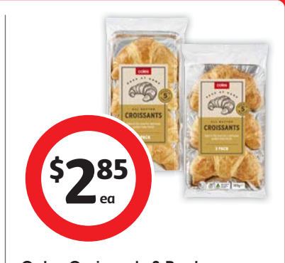
Coles Croissants 3 Pack or 4 Pack Selected stores only