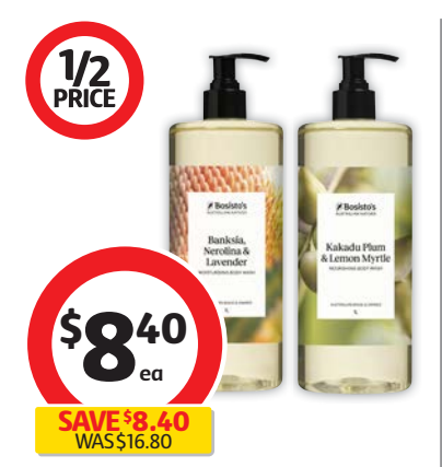
Bosisto's Body Wash 1 Litre $0.84 per 100mL