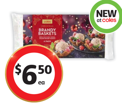
Christmas Brandy Baskets 8 Pack 96g $6.77 per 100g