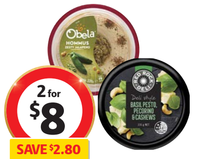
Obela Dip 220g or Red Rock Deli Dip 135g