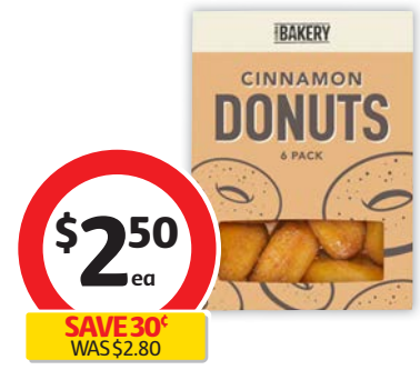
Coles Bakery Cinnamon Donuts 6 Pack $0.42 per each. Selected stores only