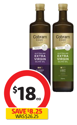
Cobram Estate Olive Oil 750mL $2.40 per 100mL