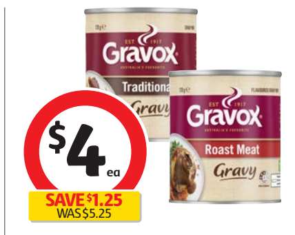
Gravox Gravy Canister 120g-140g