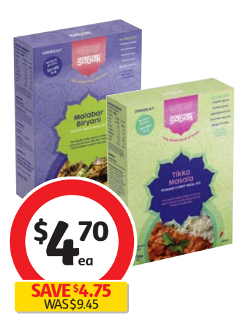
Sadak Indian Meal Kit 600g-624g