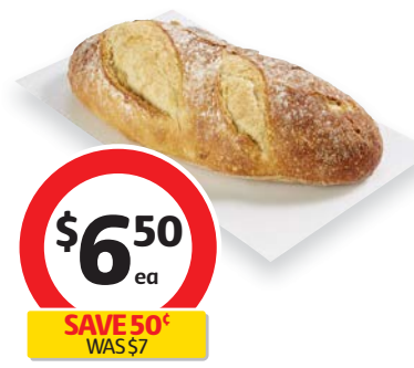
Coles Finest by Laurent Sourdough Vienna or Cob Selected stores only