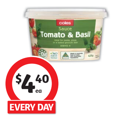
Coles Pasta Sauce 425g $1.04 per 100g