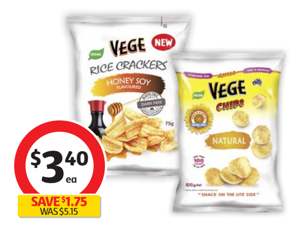
Vege Chips 100g or Rice Crackers 75g