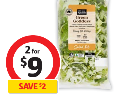
Coles Kitchen Green Goddess Salad Kit 350g Pack $12.86 per kg