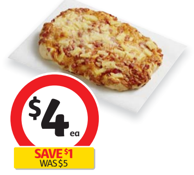
Coles Bakery Tear & Share Selected stores only