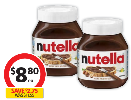
Nutella Hazelnut Chocolate Spread 750g $1.17 per 100g