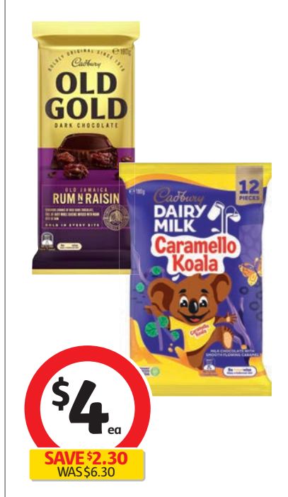
Cadbury Old Gold Block Chocolate 170g-180g or Cadbury Sharepacks 120g-180g