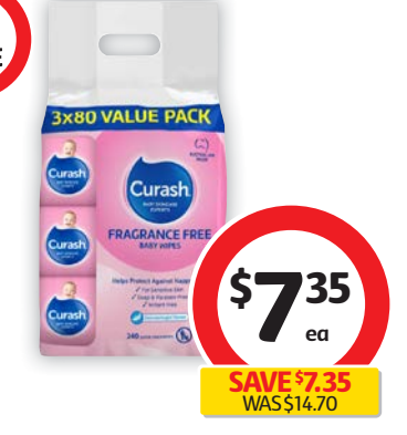
Curash Fragrance Free Baby Wipes 240 Pack $3.06 per 100 each