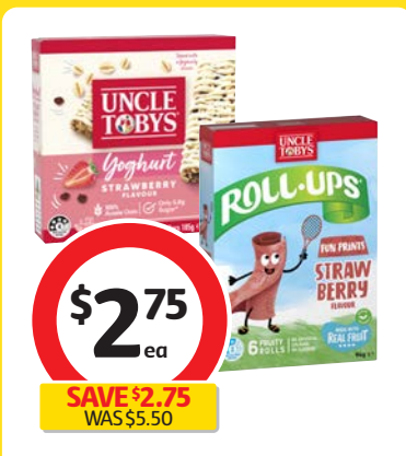
Uncle Tobys Muesli Bars 185g or Roll Ups 94g