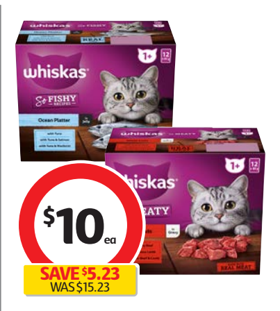
Whiskas Oh So Cat Food 12x85g $0.98 per 100g