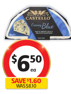
Castello Creamy Blue or Brie 150g $43.33 per kg