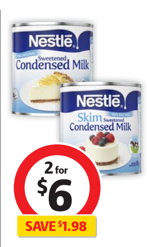
Nestlé Sweetened Condensed Milk 395g-410g