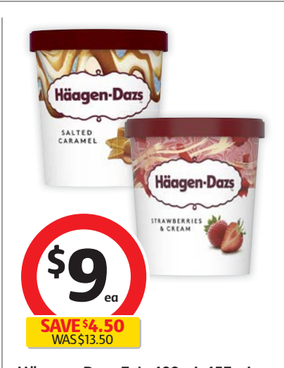
Häagen Dazs Tub 420mL-457mL