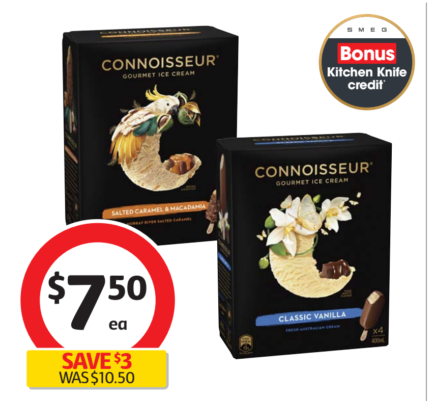
Peters Connoisseur 4 Pack 360mL-400mL 2nd week on sale. *See page 33 for T&Cs