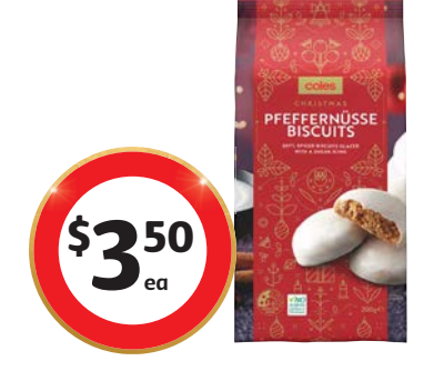
Coles Christmas Pfeffernüsse Biscuits 200g $1.75 per 100g