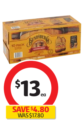
Bundaberg Brewed Soft Drinks 10x375mL $3.47 per litre