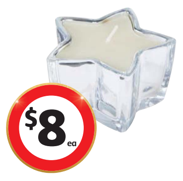
Christmas Silver Star Candle