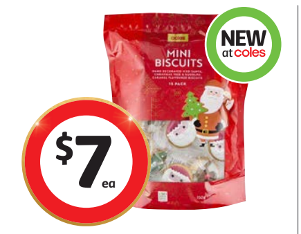
Coles Christmas Mini Biscuits 15 Pack 150g $4.67 per 100g