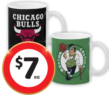
NBA Ceramic Mug