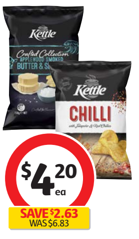
Kettle Potato Chips or Crafted Collection 150g-165g