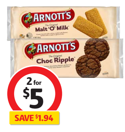
Arnott's Malt'o'Milk or Choc Ripple Biscuits 250g $1.00 per 100g