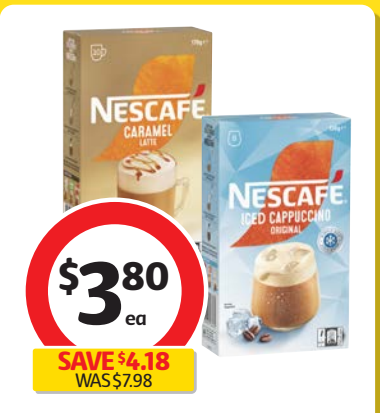
Nescafé Coffee Sachets 8 Pack-10 Pack On sale for 2 weeks