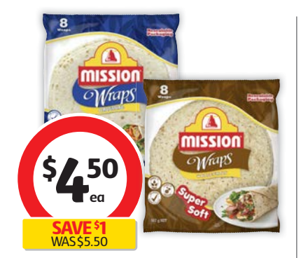
Mission Wraps 8 Pack 567g $0.97 per 100g