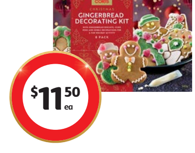
Coles Christmas Gingerbread Decorating Kit 8 Pack 343g $3.35 per 100g