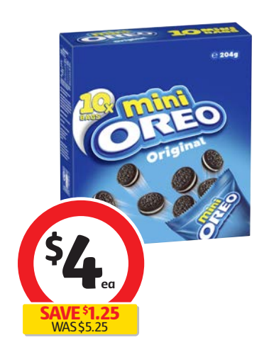
Oreo Multipack Mini Cream Biscuits 204g $1.96 per 100g