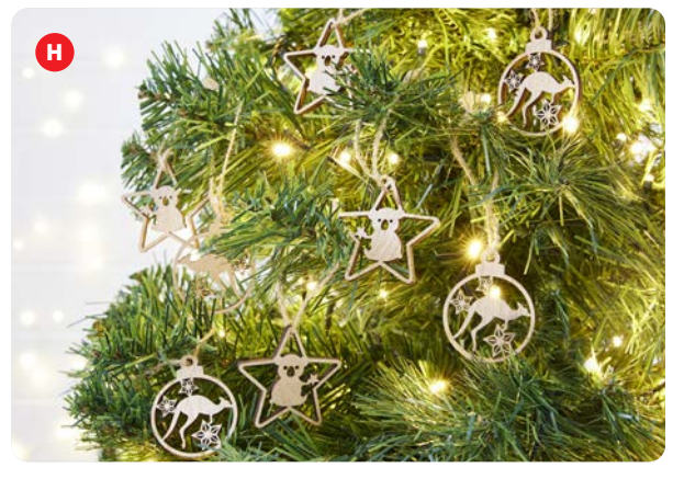
E. Wooden Gnome Hanging $5ea F. Gnome Tabletop Decoration $5ea G. LED Solar String Lights $12ea H. Australiana Mini Tree Decoration 8 Pack $5