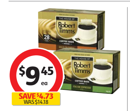
Robert Timms Coffee Bags 24 Pack-28 Pack

AVE 6.9 WAS $20.48 Moccona Freeze Dried Instant Coffee 200g $6.75 per 100g