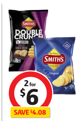
Smith's Crinkle Cut or Double Crunch Potato Chips 150g-170g