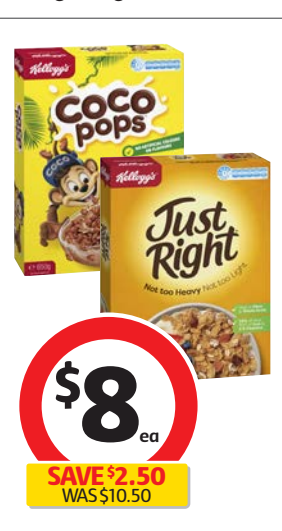
Kellogg's Coco Pops 650g or Just Right 740g