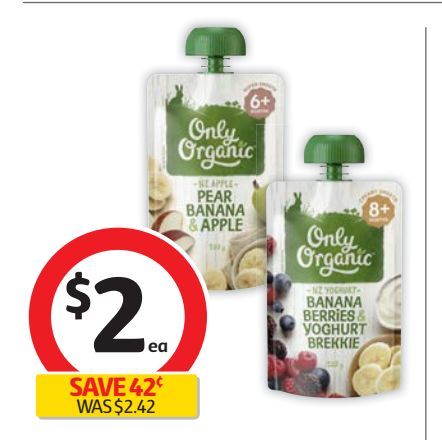
Only Organic 4+ Months, 6+ Months or 8+ Months Baby Food Pouch 120g $1.67 per 100g