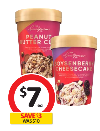
The Sweetporium Co Ice Cream 1 Litre $0.70 per 100mL