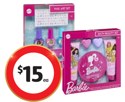
Barbie Bath Beauty Set or Nail Set