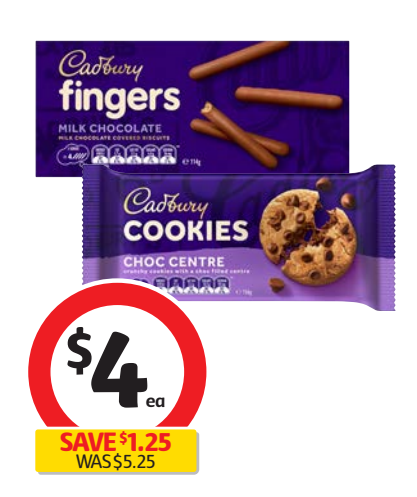
Cadbury Cookies 156g or Chocolate Finger Biscuits 114g