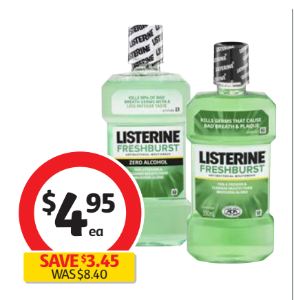
Listerine Freshburst or Freshburst Zero Mouthwash 500mL $0.99 per 100mL