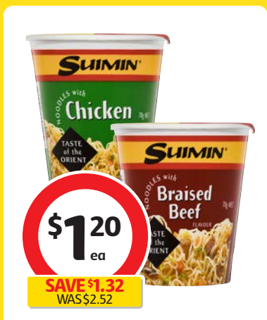
Suimin Noodle Cup 70g $1.71 per 100g