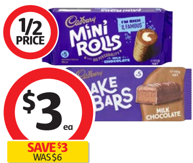
Cadbury Cake Bars or Rolls 105g-130g