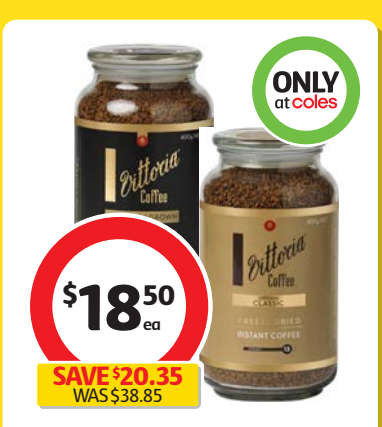
Vittoria Freeze Dried Instant Coffee 400g $4.63 per 100g