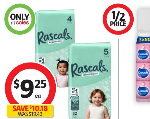
Rascals Premium Nappies 26 Pack-54 Pack