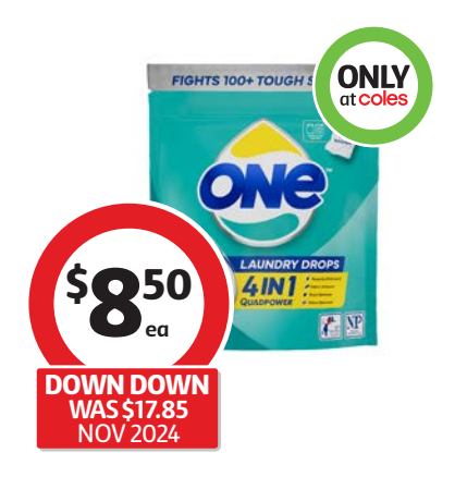
One Laundry Drops 17 Pack $0.50 per each