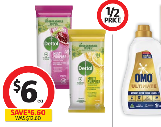
Dettol Multipurpose Wipes 110 Pack $5.45 per 100 each