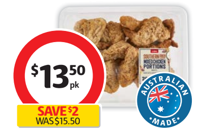
Coles RSPCA Approved Chicken Southern Fried Portions 1.2kg $11.25 per kg