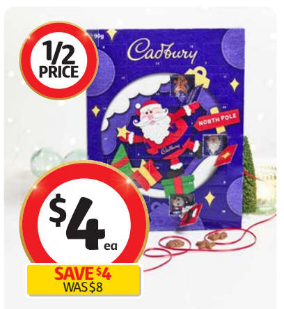
Cadbury Advent Calendar 90g $4.44 per 100g