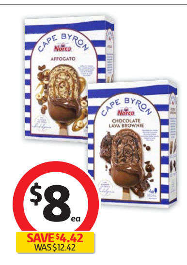
Cape Byron Ice Cream 4 Pack 378mL $2.12 per 100mL