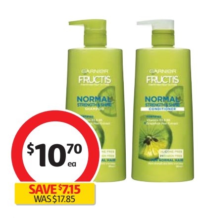
Garnier Fructis Shampoo or Conditioner 850mL $1.26 per 100mL