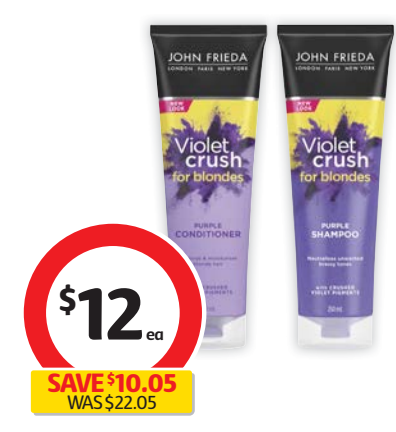
John Frieda Violet Crush Tone Refresh Shampoo or Conditioner 250mL $4.80 per 100mL