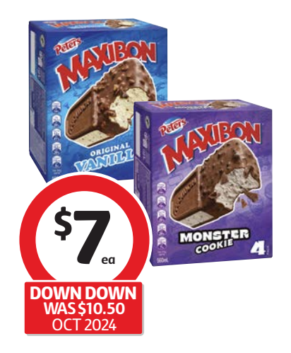
Peters Maxibon Ice Cream 4 Pack 560mL $1.25 per 100mL