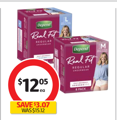
Depend Adult Care Real Fit Incontinence Underwear Medium or Large 8 Pack $1.51 per each. On sale for 2 weeks