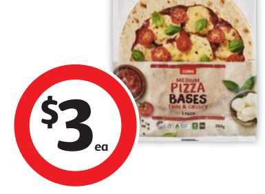
Coles Thin & Crispy Pizza Base Medium 200g $1.50 per 100g