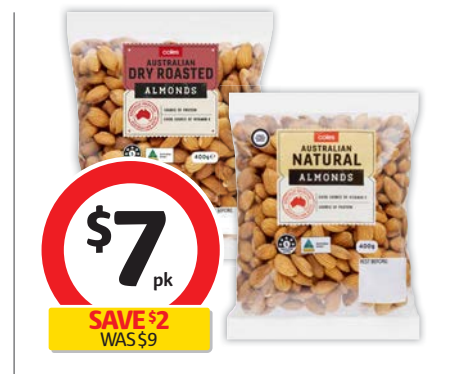
Coles Dry Roasted, Natural or Smoked Almonds 400g Pack $17.50 per kg