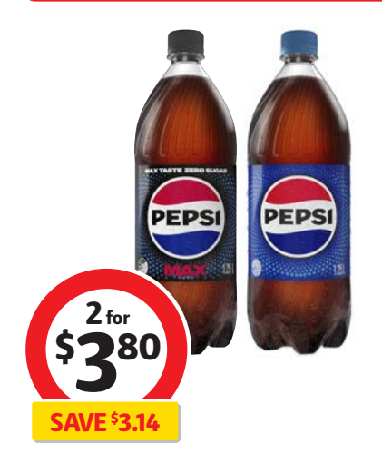
Pepsi or Solo Soft Drink 1.25 Litre $1.52 per litre