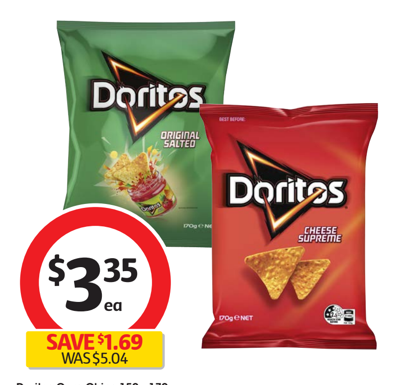
Doritos Corn Chips 150g-170g