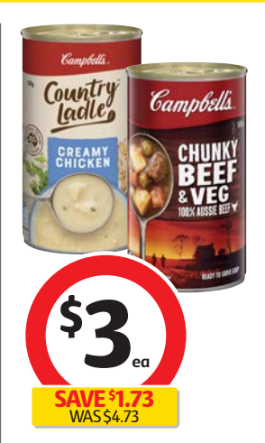
Campbell's Country Ladle or Chunky Soup 495g-505g