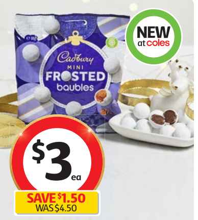
Cadbury Mini Frosted Baubles 80g $3.75 per 100g. On sale for 2 weeks