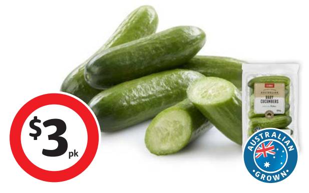
Coles Australian Baby Cucumbers 250g Pack $12.00 per kg