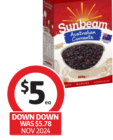
Sunbeam Australian Currants 300g $16.67 per kg