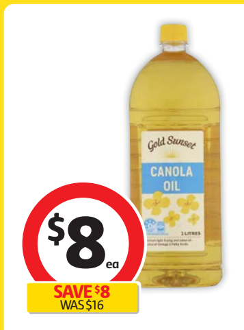
Gold Sunset Canola Oil 2 Litre $0.40 per 100mL