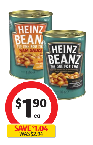
Heinz Baked Beanz or Spaghetti 300g $0.63 per 100g