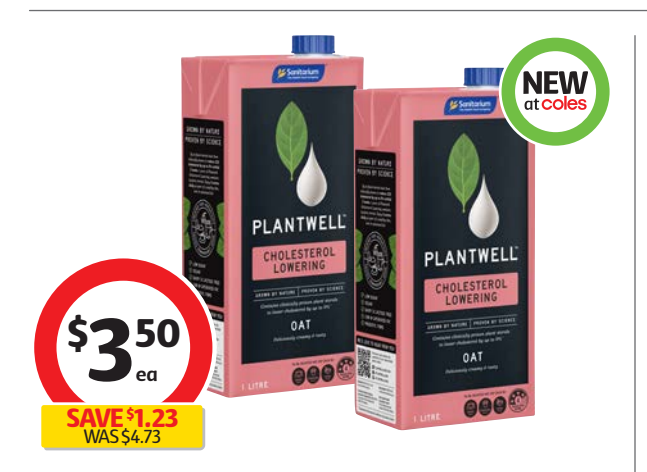
Sanitarium Plantwell Cholesterol Lowering Oat Milk 1 Litre $3.50 per litre