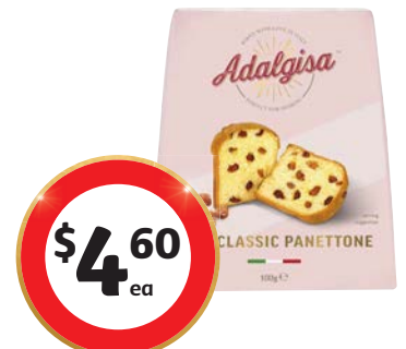
Adalgisa Mini Classic Panettone 100g $4.60 per 100g