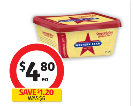
Western Star Spreadable Blend 375g $1.28 per 100g