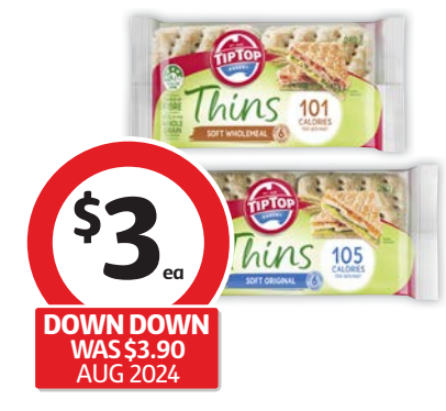
Tip Top Thins 6 Pack 200g-240g