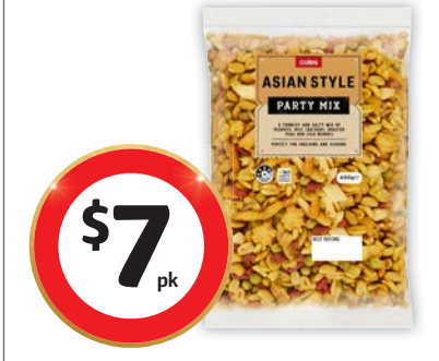
Coles Savoury Asian Style Party Mix 400g Pack $17.50 per kg. While stocks last. No rainchecks