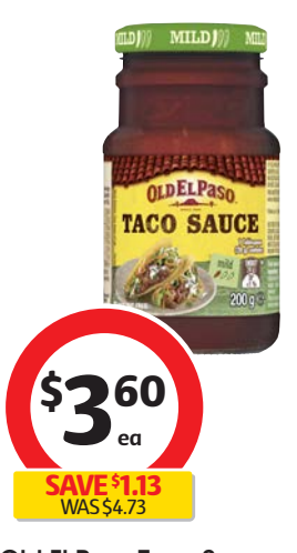
Old El Paso Taco Sauce 200g $1.80 per 100g