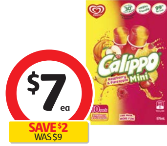
Streets Calippo 10 Pack 575mL or Cyclone 8 Pack 688mL