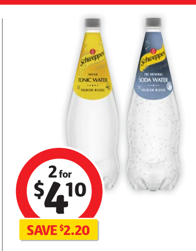
Schweppes Mixers, Soft Drink or Mineral Water 1.1 Litre $1.86 per litre