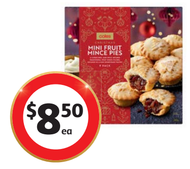
Coles Christmas Mini Fruit Mince Pies 9 Pack 243g $3.50 per 100g