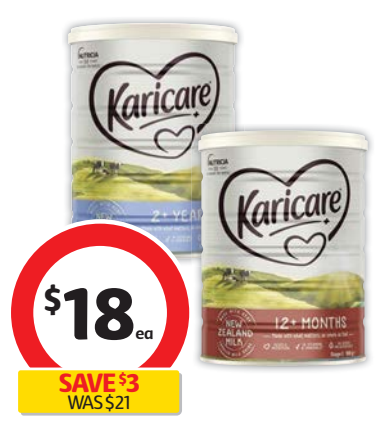
Karicare Toddler Stage 3 or 4 Milk Drink 900g $2.00 per 100g