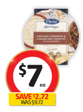
Chris' Heritage Dip 170g $4.12 per 100g