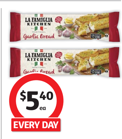
La Famiglia Garlic Bread 400g $1.35 per 100g