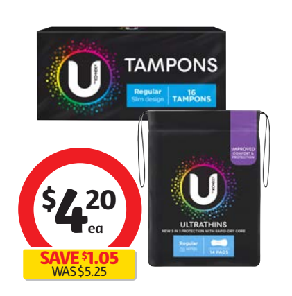
U By Kotex Regular Ultra Thin Pads with Wings 14 Pack or Regular Tampons 16 Pack