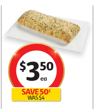
Coles Bakery Stone Baked Turkish Loaf Selected stores only. 2nd week on sale