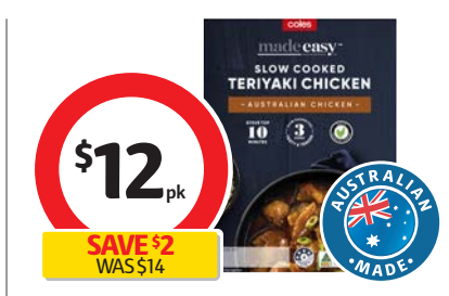
Coles Made Easy Slow Cooked Teriyaki Chicken 700g $17.14 per kg