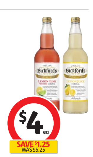
Bickford's Cordial 750mL $5.33 per litre. On sale for 2 weeks