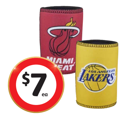
NBA Can Cooler