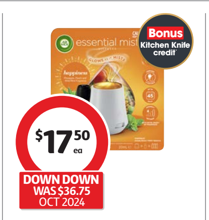
Air Wick Essential Mist Aroma Diffuser 20mL $8.75 per 10mL. *See page 33 for T&Cs