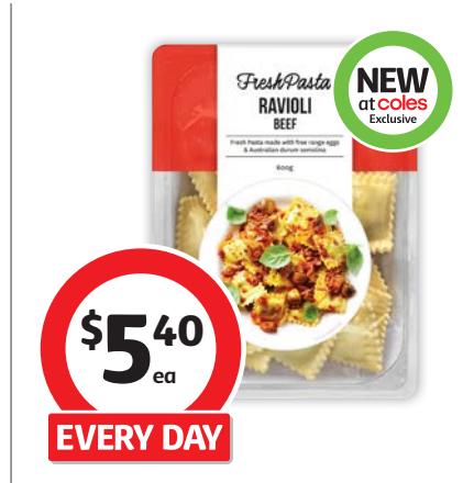
Fresh Pasta Beef Ravioli 600g $0.90 per 100g