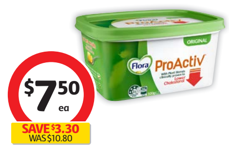
Flora ProActiv 500g $1.50 per 100g