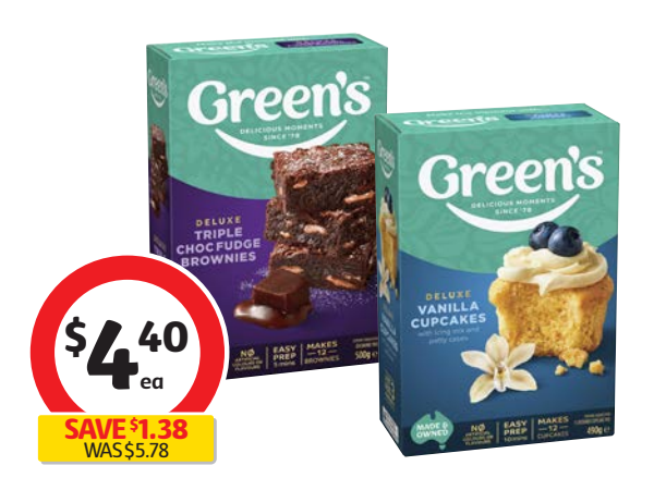
Green's Deluxe Baking Mix 380q-630q