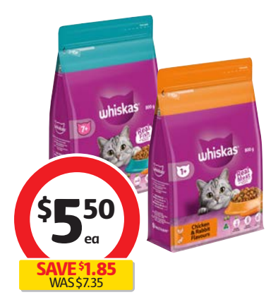
Whiskas Dry Cat Food 800g $0.69 per 100g