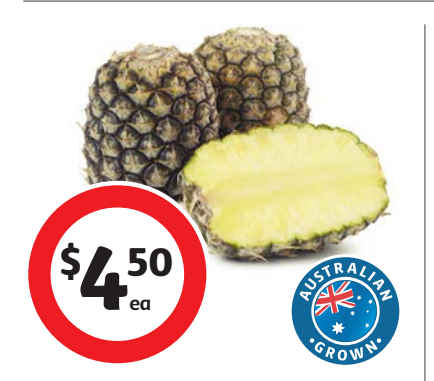
Australian Topless Pineapples