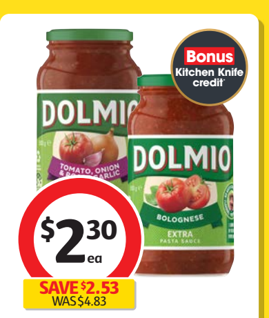
Dolmio Extra Pasta Sauce 490g-500g *See page 33 for T&Cs