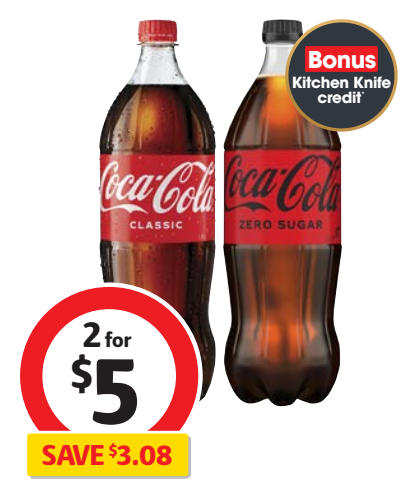
Coca-Cola Soft Drink 1.25 Litre $2.00 per litre. *See page 33 for T&Cs