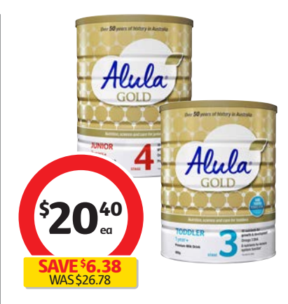
Alula Gold Stage 3 Toddler or Stage 4 Junior Milk Drink 900g $2.27 per 100g