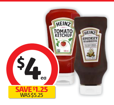
Heinz Tomato Ketchup or Smokey Barbeque Sauce 500mL $0.80 per 100mL