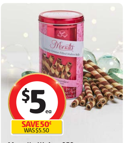
Monetta Wafers 350g $1.43 per 100g. On sale for 2 weeks