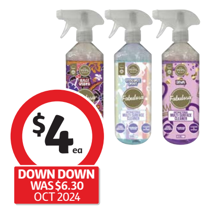
Fabulosa Multi-Surface Antibacterial Cleaner 500mL $0.80 per 100mL