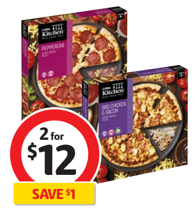
Coles Kitchen Pizza 360g-410g