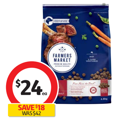
Farmers Market Dry Dog Food 6.5kg-6.8kg