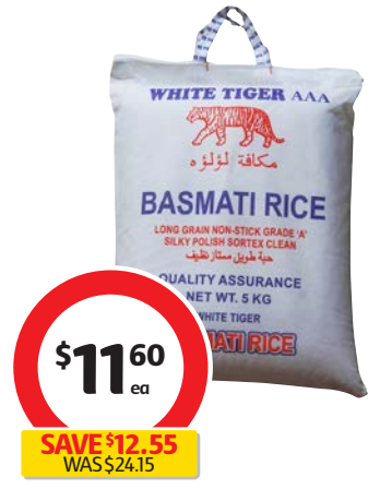
White Tiger Basmati Rice 5kg $0.23 per 100g