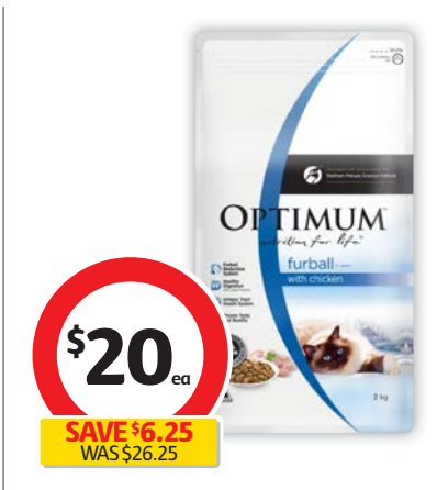
Optimum Dry Cat Food 1.8kg-2kg On sale for 2 weeks