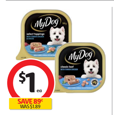
My Dog Dog Food Tray 100g $1.00 per 100g. Excludes My Dog Shredded