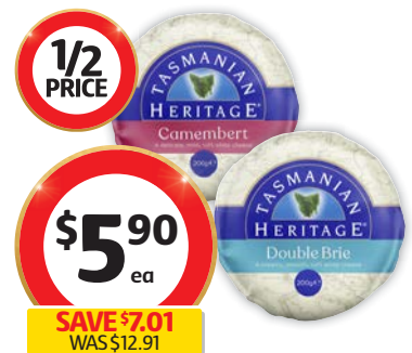
Tasmanian Heritage Double Cream Brie or Camembert 200g $29.50 per kg