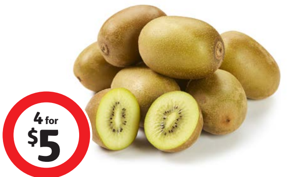
Gold Kiwifruit Single sell for $1.50. $1.25 per kiwifruit when you buy 4