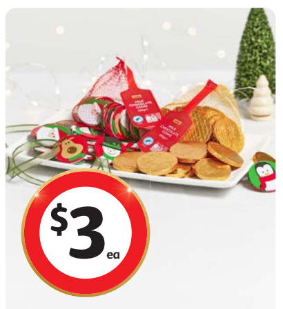
Coles Christmas Milk Chocolate Coins 150g $2.00 per 100g