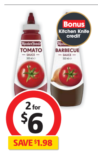
MasterFoods Squeeze Tomato or Barbecue Sauce 475mL-500mL *See page 33 for T&Cs