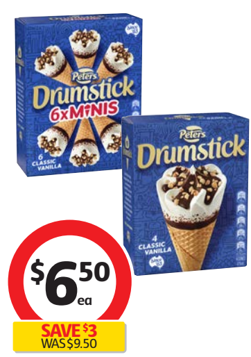
Peters Drumstick 4 Pack-6 Pack 475mL-490mL