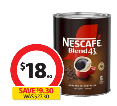
Nescafé Blend 43 500g $3.60 per 100g

AVE 6.9 WAS $20.48 Moccona Freeze Dried Instant Coffee 200g $6.75 per 100g