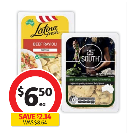
Latina Filled Pasta 375g or 25 Degrees South Ravioli 325g