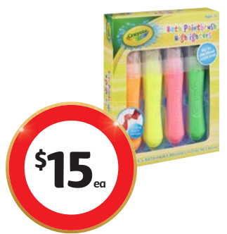
Crayola 36 Bath Numbers & Letters or Bath Paintbrush Highlighters