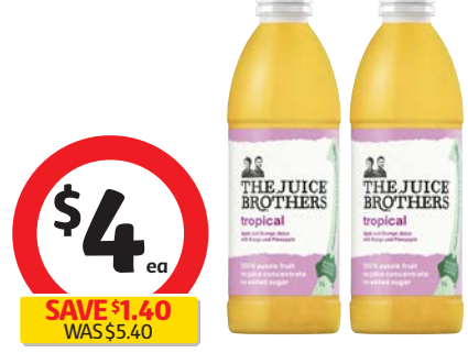
The Juice Brothers Juice 1 Litre $4.00 per litre. Excludes Orange Juice