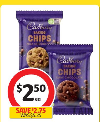
Cadbury Baking Chocolate Blocks, Melts or Chips 180g-225g