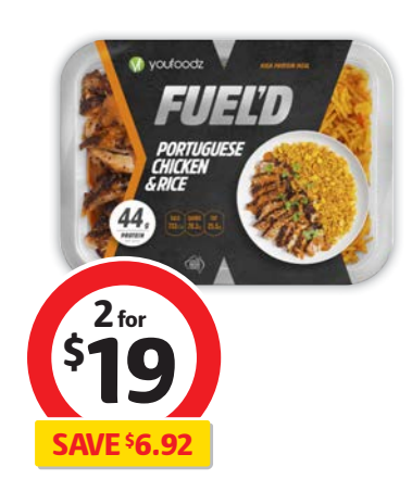
Youfoodz Fuel'd Meal 400g-444g