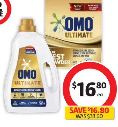
Omo Ultimate Laundry Liquid 2 Litre or Powder 2kg