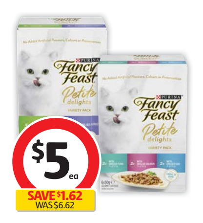
Fancy Feast Petite Delights Cat Food 6x50g $1.67 per 100g