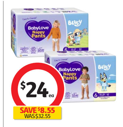
BabyLove Jumbo Nappy Pants 42 Pack-56 Pack 2nd week on sale