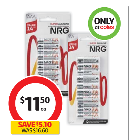
NRG Batteries AA or AAA 14 Pack $0.82 per each. On sale for 2 weeks