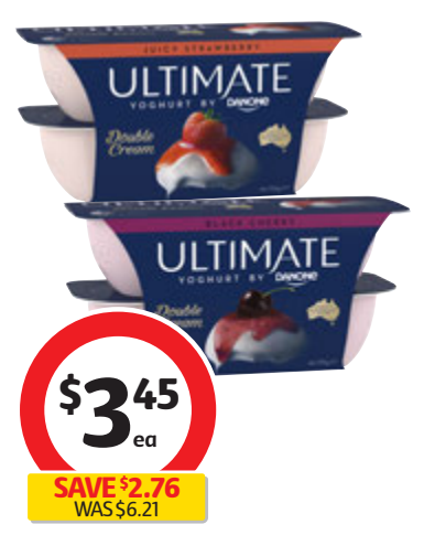
Danone Ultimate Yoghurt 4x115g $0.75 per 100g