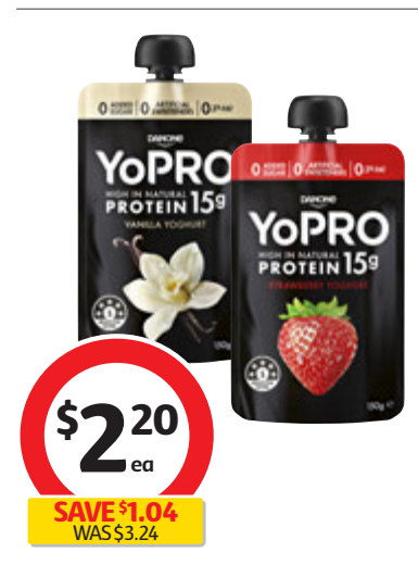
Danone YoPro Protein Yoghurt Pouch 150g $1.47 per 100g