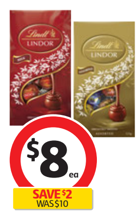
Lindt Lindor Gift Bag 121g-125g