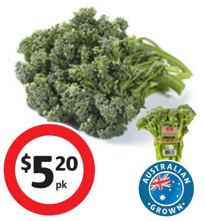
Coles Australian Family Broccolini Pack