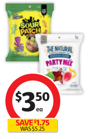
The Natural Confectionery Co. 130g-230g or Sour Patch 190g