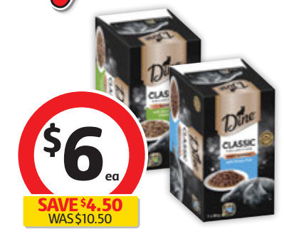
Dine Daily Cat Food 7x85g $1.01 per 100g