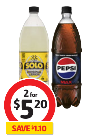
Pepsi, Solo or Sunkist Soft Drink 1.25 Litre $2.08 per litre