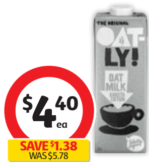
Oatly Barista Oat Milk 1 Litre $4.40 per litre