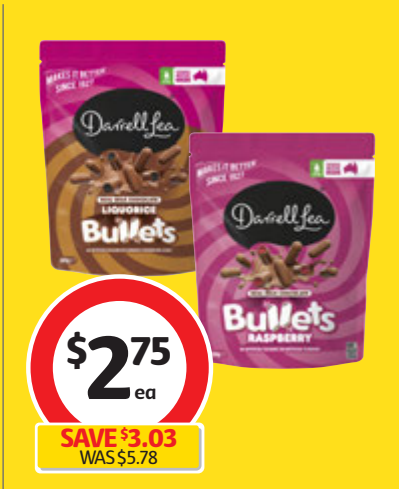
Darrell Lea Bullets, Twists, BBs & Liquorice 168g-280g