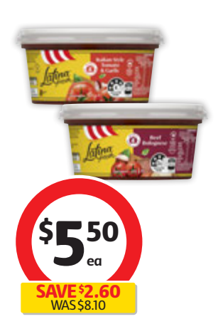
Latina Pasta Sauce 425g $1.29 per 100g. On sale for 2 weeks