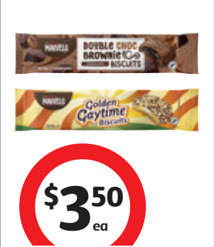
Griffin's Marvels Biscuits 165g-200g