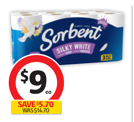
Sorbent 3-Ply Silky White Toilet Tissue 16 Pack $0.31 per 100 sheets