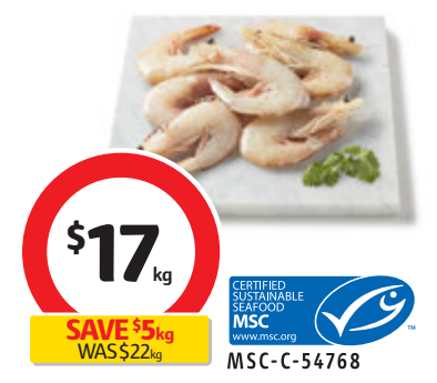
Coles Australian MSC Thawed Raw Banana Prawns Selected stores only*