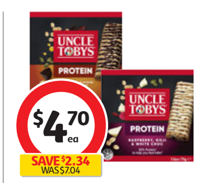
Uncle Tobys Protein Muesli Bars 175g $2.69 per 100g