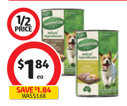
Nature's Gift Dog Food 700g $0.26 per 100g. On sale for 2 weeks