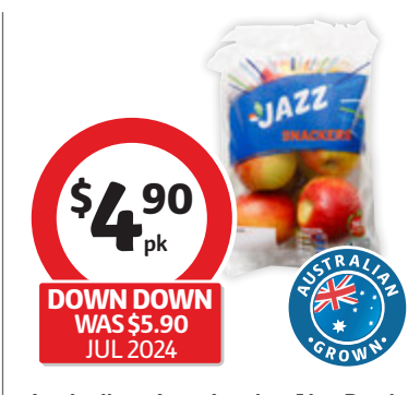
Australian Jazz Apples 1kg Pack $4.90 per kg