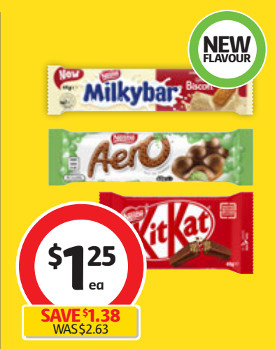
Nestlé Chocolate Bar 35g-50g