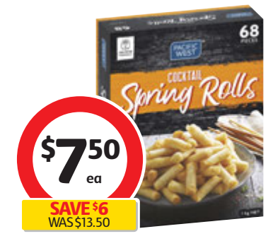
Pacific West Cocktail Spring Rolls 1kg $0.75 per 100g