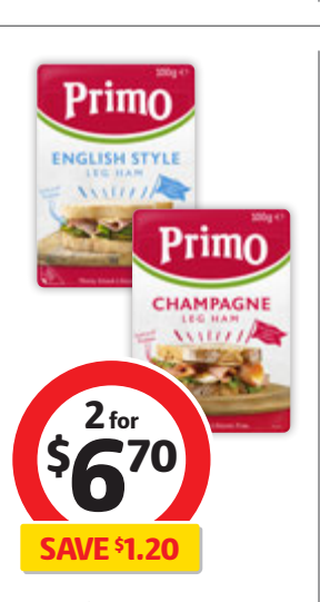
Primo Sliced Meats 80g-100g 2nd week on sale