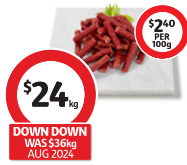
Hans Twiggy Sticks Selected stores only*