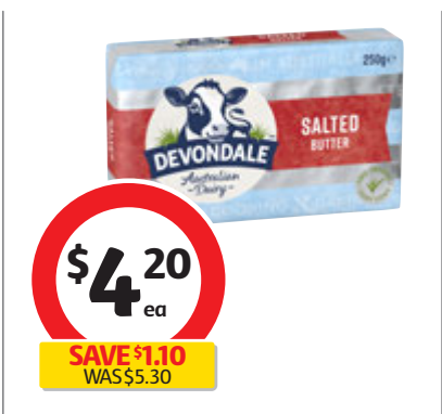
Devondale Butter 250g $1.68 per 100g