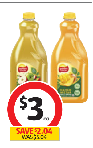
Golden Circle Juice 2 Litre $1.50 per litre. Excludes Pineapple, Grape, Orange and Orange & Mango