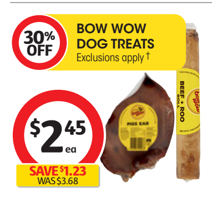
Bow Wow Dog Treats Pigs Ear or Beef Roo 1 Pack $2.45 per each