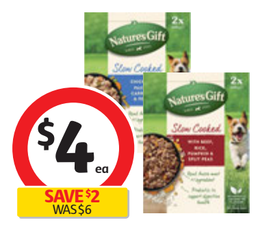
Nature's Gift Slow Cooked Dog Food 2x220g $0.91 per 100g. From the chilled pet food fridge