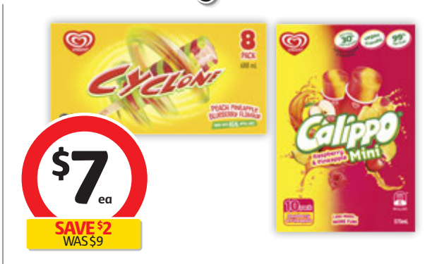
Streets Calippo Multi Pack 575mL or Cyclone Multi Pack 688mL 2nd week on sale