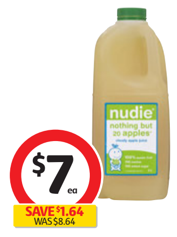
Nudie Juice 2 Litre $3.50 per litre. Excludes Orange Juice