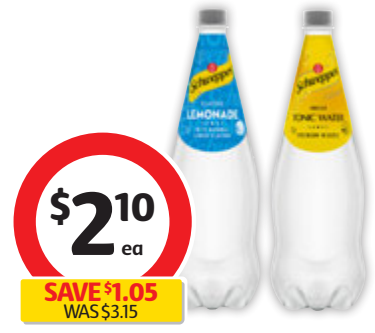
Schweppes Mixers, Soft Drink or Mineral Water 1.1 Litre $1.91 per litre