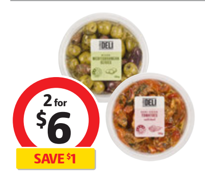
Coles Brand Pre-Packed Antipasto 110g-135g Selected stores only#