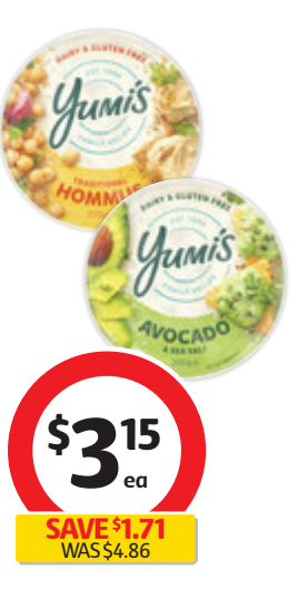
Yumi's Dip 200g $1.58 per 100g