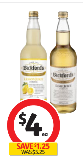
Bickford's Cordial 750mL $5.33 per litre