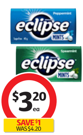
Eclipse Mints 40g $8.00 per 100g