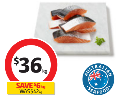
Coles Tasmanian Fresh Salmon Portions Skin On 2nd week on sale. Selected stores only*