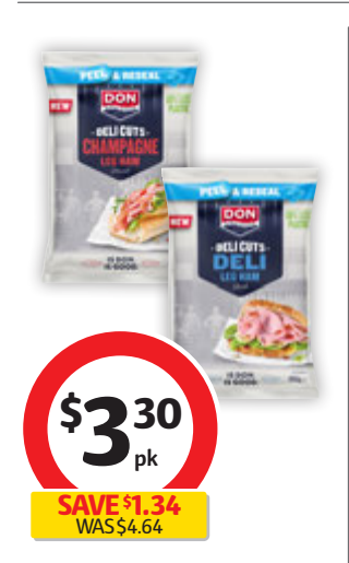
Don Deli Cuts 80g-100g