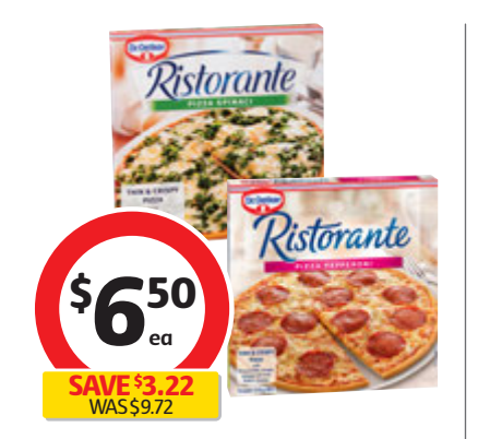
Dr. Oetker Ristorante Pizza 310g-390g