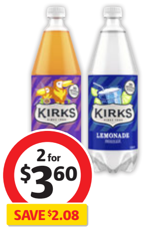
Kirks Soft Drink 1.25 Litre $1.44 per litre