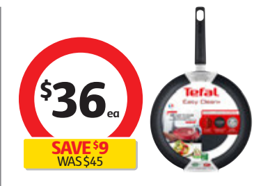
Tefal Easy Clean Frypan 30cm