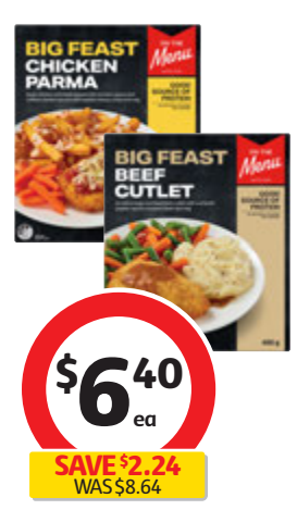
On The Menu Big Feast Meal 480g $1.33 per 100g