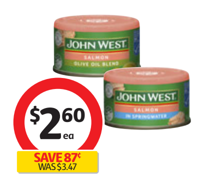
John West Salmon Tempters 95g $27.37 per kg