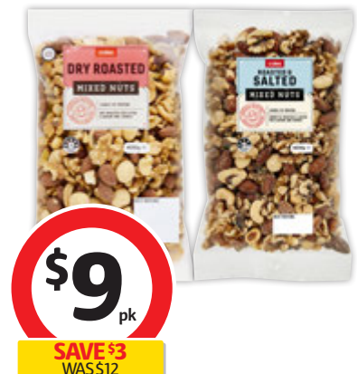
Coles Dry Roasted or Roasted & Salted Mixed Nuts 400g Pack $22.50 per kg