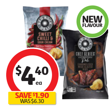
Red Rock Deli Potato Chips 150g-165g