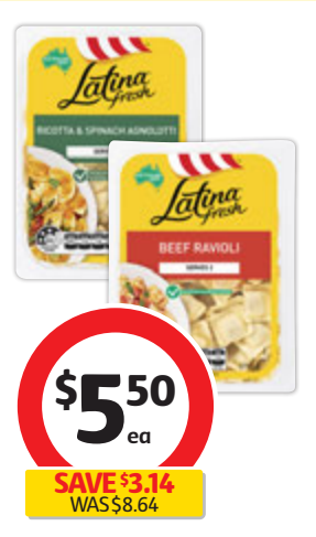
Latina Filled Pasta 375g $1.47 per 100g