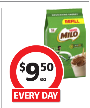
Nestlé Milo Softpack 650g $1.46 per 100g