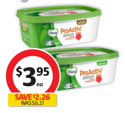
Flora ProActiv 250g $1.58 per 100g