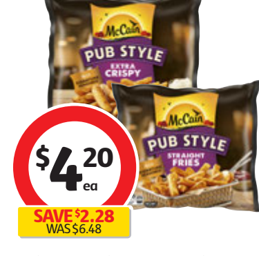
McCain Pub Style Fries 750g $5.60 per kg