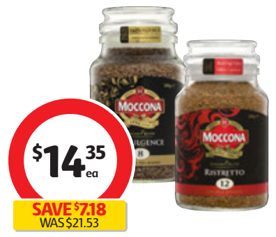
Moccona Specialty Blend Instant Coffee 200g $7.18 per 100g