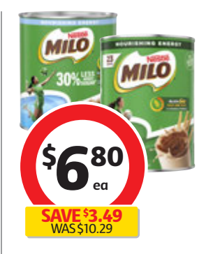
Nestlé Milo 395g-460g