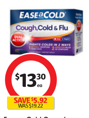
Ease a Cold Capsules Cough, Cold & Flu 24 Pack^ $0.55 per each