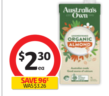
Australia's Own Organic Almond Milk 1 Litre $2.30 per litre