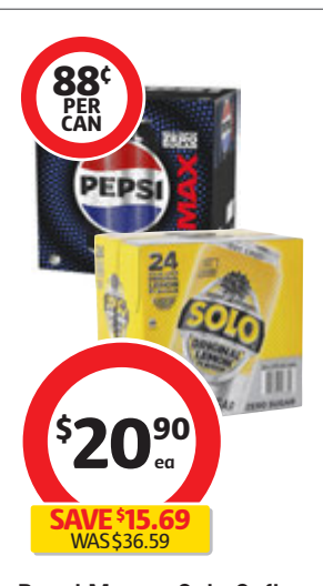
Pepsi Max or Solo Soft Drink 24x375mL $2.32 per litre