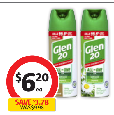
Glen 20 Disinfectant Spray 300g $2.07 per 100g