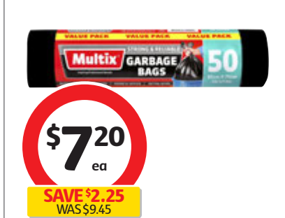
Multix Strong & Reliable Garbage Bags 50 Pack $0.14 per each