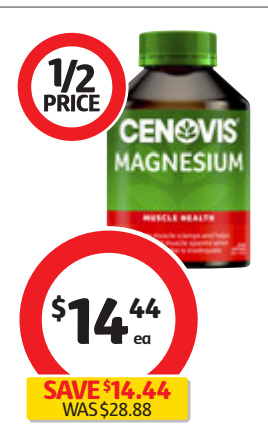
Cenovis Magnesium Tablets 200 Pack^ $7.22 per 100 each