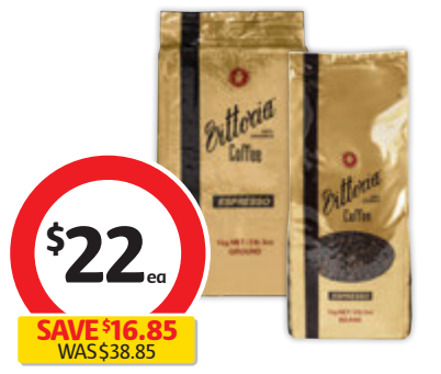
Vittoria Espresso Coffee Beans or Ground 1kg $2.20 per 100g