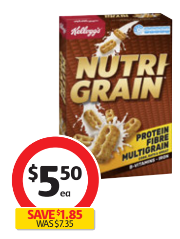
Kellogg's Nutri Grain 290g $1.90 per 100g