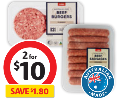
Coles Classic Burgers or Sausages 400g-550g