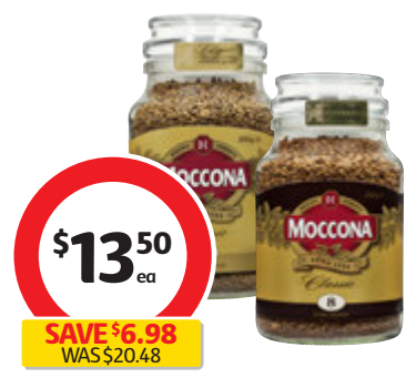
Moccona Freeze Dried Instant Coffee 200g $6.75 per 100g