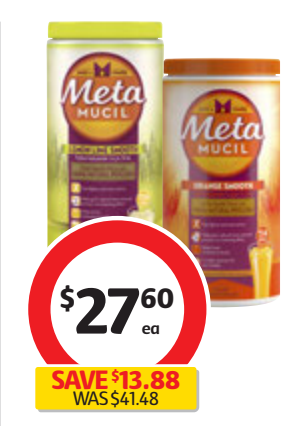
Metamucil 114 Doses 673g<sup>^</sup> $4.10 per 100g

†Excludes Every Day, Down Down & clearance items