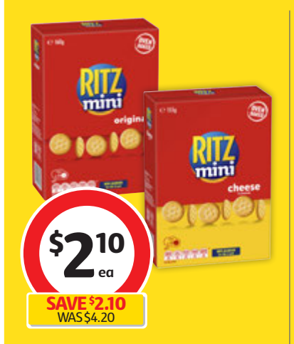
Ritz Sharepack Mini Crackers 155g-160g