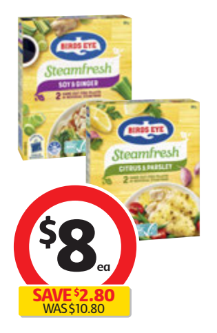
Birds Eye Steamfresh Fish 380g $21.05 per kg