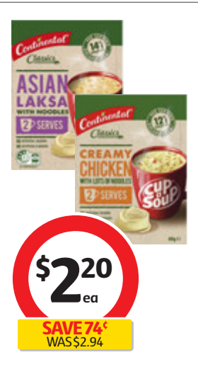
Continental Cup a Soup 2 Serves 50g-75g