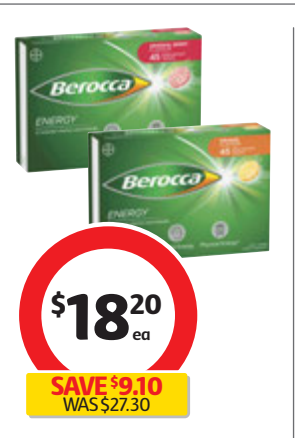
Berocca Energy Effervescents 45 Pack^ $40.44 per 100 each