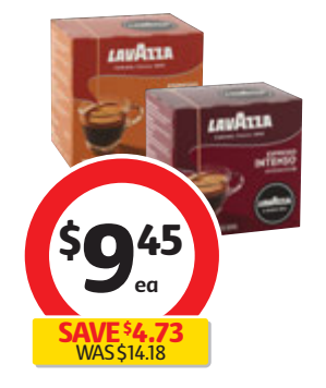
Lavazza A Modo Mio Coffee Capsules 16 Pack $0.59 per each