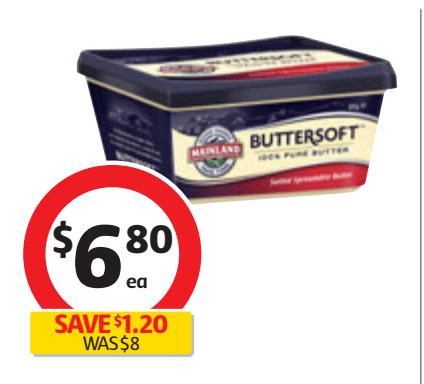
Mainland Buttersoft 375g $1.81 per 100g