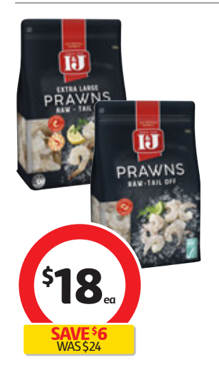
I&J Raw Prawns Tail On or Off 500g $36.00 per kg