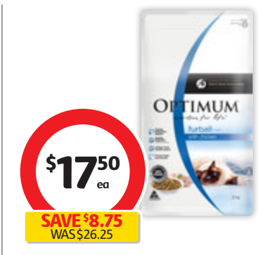
Optimum Dry Cat Food 1.8kg-2kg