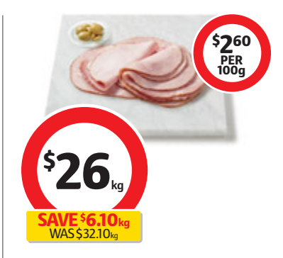
Don Premium Melosi Leg Ham Selected stores only#