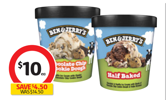
Ben & Jerry's Tubs 427mL-465mL