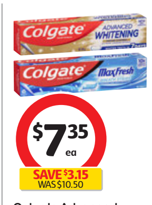
Colgate Advanced Tartar & Whitening or Max Fresh Toothpaste 200g $3.68 per 100g