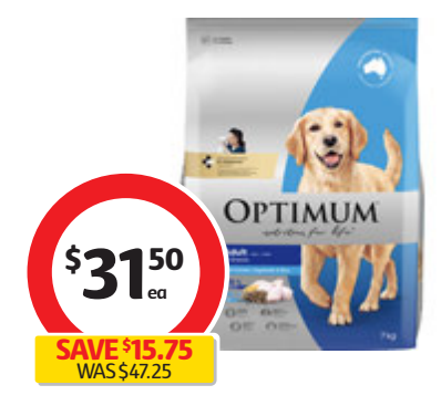
Optimum Dry Dog Food 7kg $0.45 per 100g