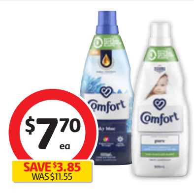
Comfort Fabric Conditioner 900mL $8.56 per litre