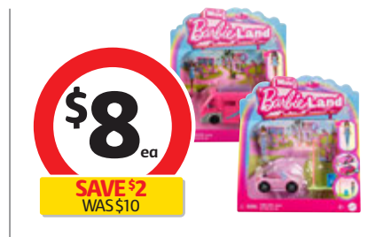
Mini Barbieland Vehicle Assortment 1 Each