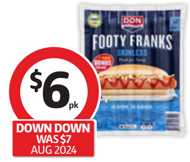
Don Skinless Footy Franks 435g $13.79 per kg