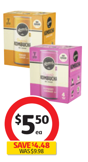
Remedy Kombucha 4x250mL $5.50 per litre