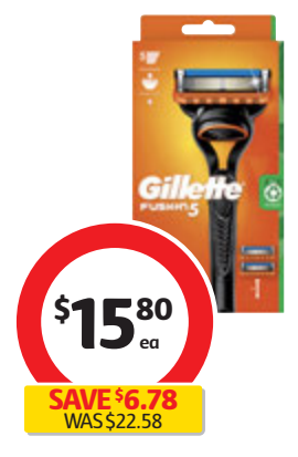
Gillette Fusion 5 Razor Kit with 2 Refill Blades 1 Pack