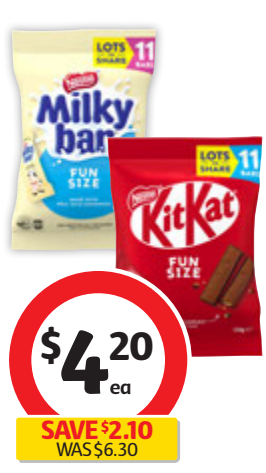
Nestlé Chocolate Fun Pack 127g-158g