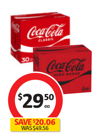
Coca-Cola Soft Drink 30x375mL $2.62 per litre