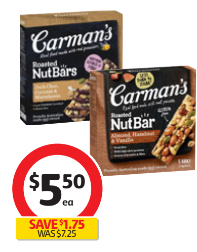
Carman's Nut or Muesli Bars 150g-270g