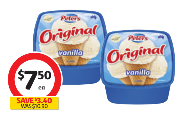
Peters Original 4 Litre $0.19 per 100mL