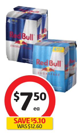
Red Bull Energy Drink 4x250mL $7.50 per litre