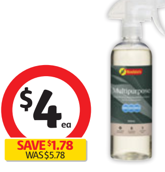
Bosistos Multipurpose Cleaner 500mL $0.80 per 100mL