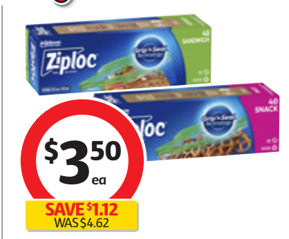
Ziploc Sandwich or Snack Bags 40 Pack $0.09 per each. 2nd week on sale