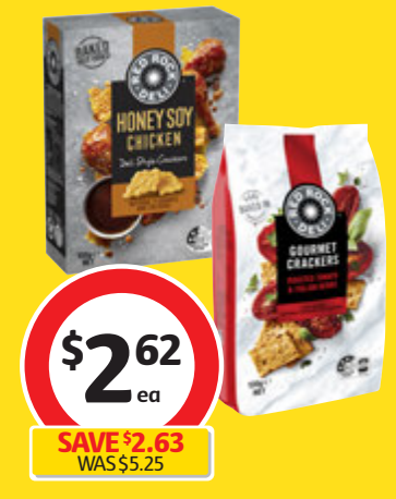
Red Rock Deli Gourmet, Deli Style or Crostini Crackers 115g-135g