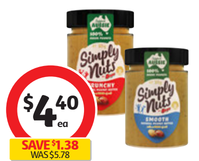
Bega Simply Nuts Smooth or Crunchy Peanut Butter 325g $1.35 per 100g