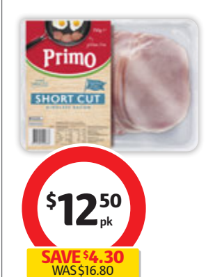
Primo Rindless Short Cut Bacon 750g $16.67 per kg