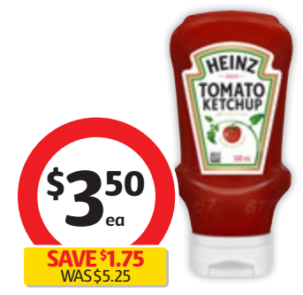
Heinz Tomato Ketchup 500mL $0.70 per 100mL