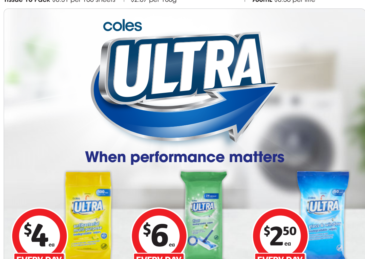
Coles Ultra Biodegradable Floor Wipes Refill 24 Pack $0.25 per each