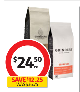
Grinders Coffee Beans 1kg $2.45 per 100g