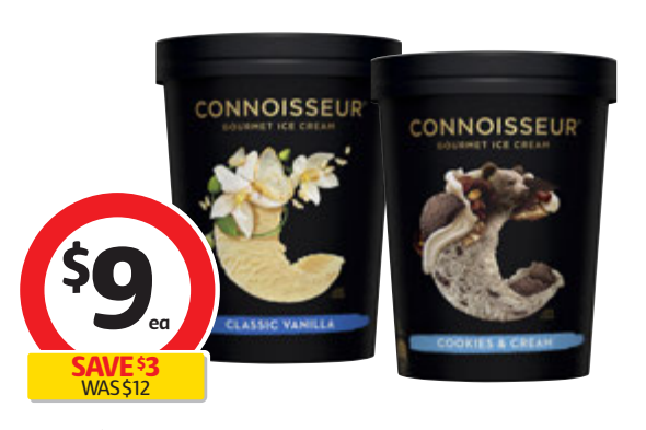
Peters Connoisseur 1 Litre $0.90 per 100mL