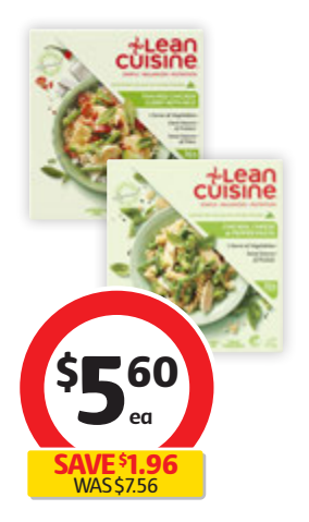
Lean Cuisine Dinner Meal 375g $1.49 per 100g