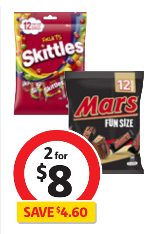
Mars Chocolate Fun Size 132g-192g or Skittles Fun Size 180g