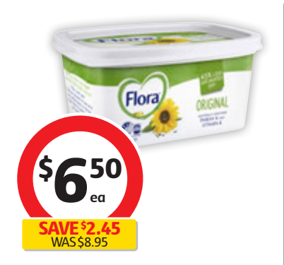
Flora Margarine 1kg $0.65 per 100g