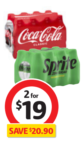
Coca-Cola, Fanta or Sprite Soft Drink 12x300mL $2.64 per litre