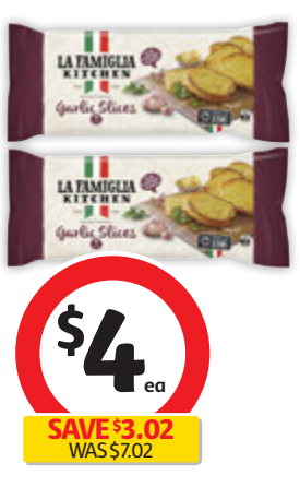
La Famiglia Garlic Bread Slices 270g $1.48 per 100g