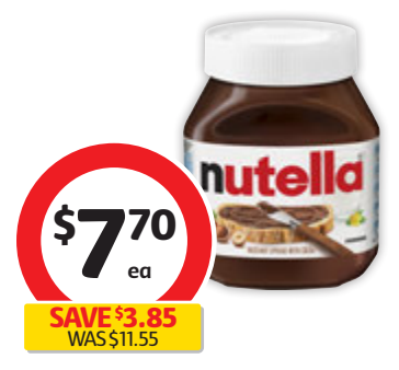
Nutella Hazelnut Chocolate Spread 750g $1.03 per 100g