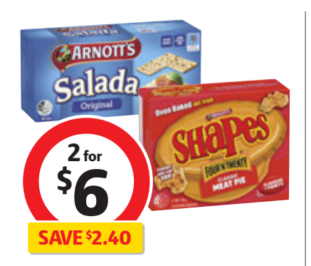
Arnott's Shapes Crackers 130g-190g or Salada Crispbread 250g