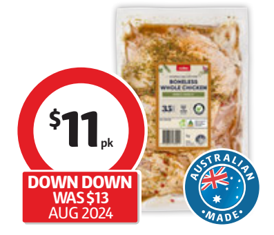
Coles RSPCA Approved Chicken Boneless Herb and Garlic 1kg $11.00 per kg