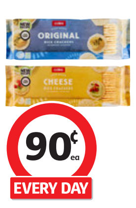
Coles White Rice Crackers 100g $0.90 per 100g