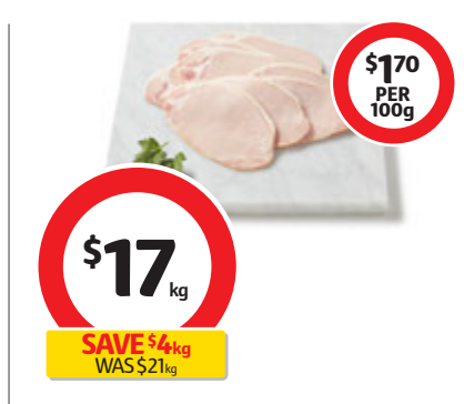
Primo Short Cut Rindless Bacon Selected stores only*