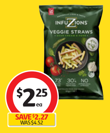
Infuzions Veggie Straws 90g $2.50 per 100g