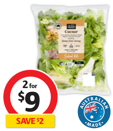
Coles Kitchen Caesar Salad Kit 290g Pack $15.52 per kg