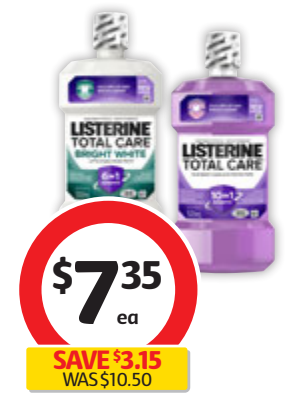
Listerine Total Care or Bright White Mouthwash 500mL $1.47 per 100mL