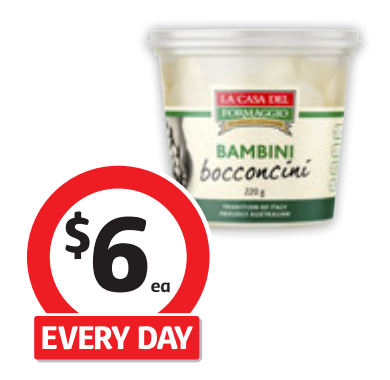
La Casa Del Formaggio Bocconcini 220g $27.27 per kg