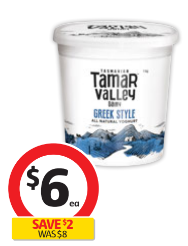
Tamar Valley Dairy Greek Style Yoghurt 1kg $0.60 per 100g