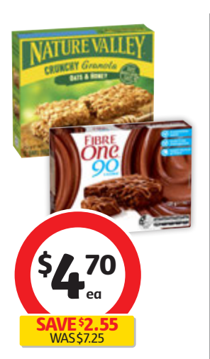
Fibre One Bars or Snacks 100g-120g or Nature Valley Bars 252g