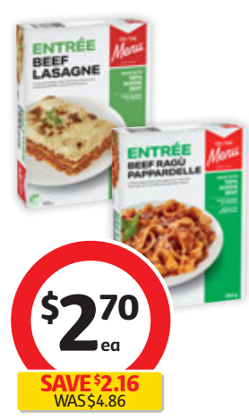
On The Menu Entrée Meal 260g $1.04 per 100g