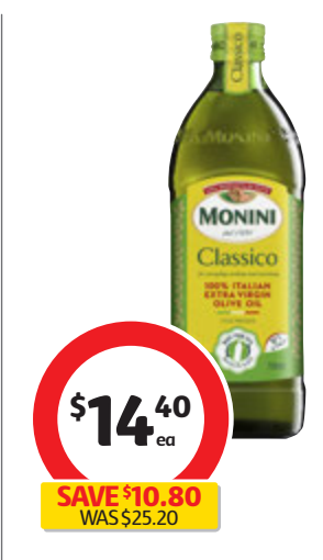
Monini Extra Virgin Olive Oil 750mL $1.92 per 100mL