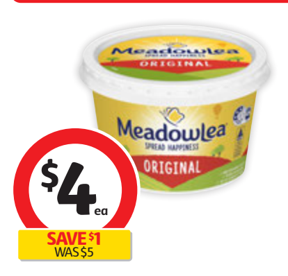
MeadowLea Dairy 500g $0.80 per 100g. On sale for 2 weeks