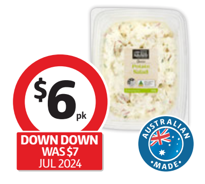
Coles Kitchen Potato Salad 800g Pack $7.50 per kg