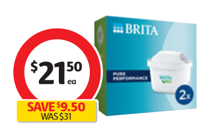
Brita Maxtra Pro Pure Performance Water Filters 2 Pack