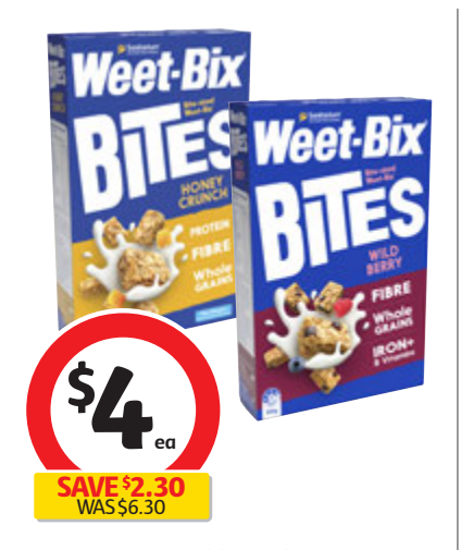
Weet-Bix Bites 500g-510g