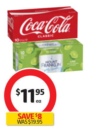
Coca-Cola, Fanta or Sprite Soft Drink or Mt Franklin Lightly Sparkling Water 10x375mL $3.19 per litre