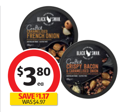
Black Swan Crafted Dip 170g $2.24 per 100g. On sale for 2 weeks