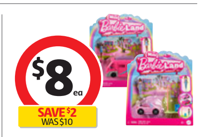
Mini Barbieland Vehicle Assortment 1 Each