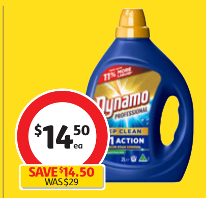
Dynamo Professional 7 In 1 Laundry Liquid 2 Litre $7.25 per litre