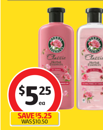
Herbal Essences Classic Shampoo or Conditioner 400mL $1.31 per 100mL

Lynx Antiperspirant Aerosol Deodorant 150mL $3.33 per 100mL