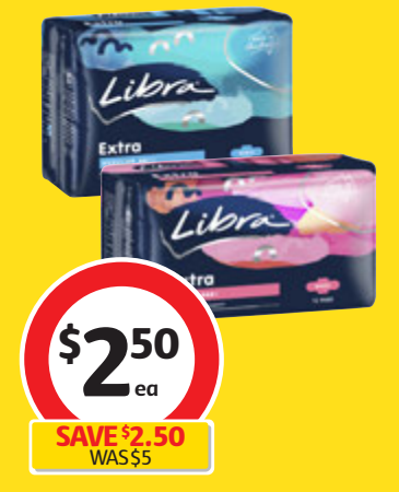
Libra Extra Pads with Wings Regular 14 Pack or Super 12 Pack