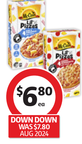
McCain Lil Pizzas 4 Pack 380g-400g