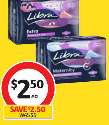
Libra Extra Long Pads with Wings Goodnights or Maternity 10 Pack $0.25 per each

Libra Body Fit Regular or Super Tampons 16 Pack $0.13 per each