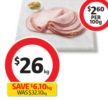
Don Premium Melosi Leg Ham Selected stores only<sup>#</sup>

Coles Brand Pre-Packed Antipasto 110g-135g Selected stores only<sup>#</sup>