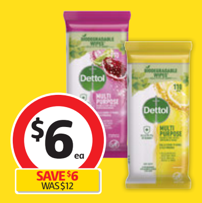
Dettol Multipurpose Wipes 110 Pack $5.45 per 100 each