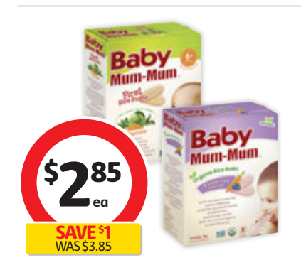
Baby Mum Mum Rusks Blueberry & Carrot or Vegetable 36g $7.92 per 100g