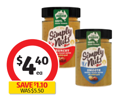
Bega Simply Nuts Smooth or Crunchy Peanut Butter 325g $1.35 per 100g

BC Snacks High Protein Bar 40g $4.38 per 100g