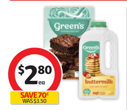
Green's Traditional Baking Mix 380g-470g or Pancake Shake 300g-375g