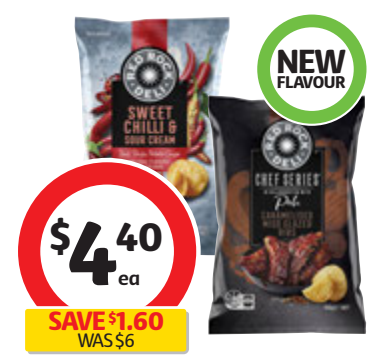
Red Rock Deli Potato Chips 150g-165g