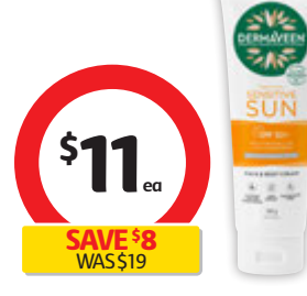
Dermaveen Sun Sensitive Sunscreen SPF50+ 100g^ $11.00 per 100g