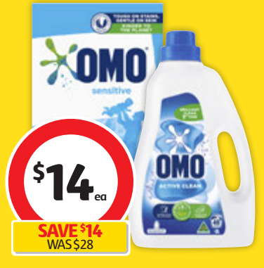
Omo Laundry Liquid 2 Litre or Powder 2kg