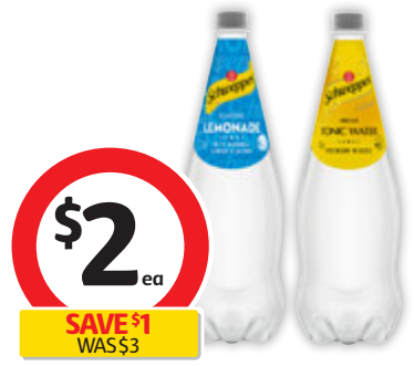
Schweppes Mixers, Soft Drink or Mineral Water 1.1 Litre $1.82 per litre