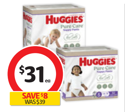
Huggies Pure Care Ultimate Nappy Pants 46 Pack-56 Pack