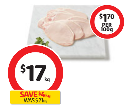
Primo Short Cut Rindless Bacon Selected stores only<sup>#</sup>