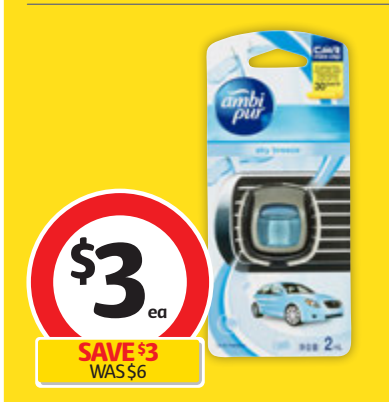
Ambi Pur Mini Clip Car Vent 2mL $15.00 per 10mL