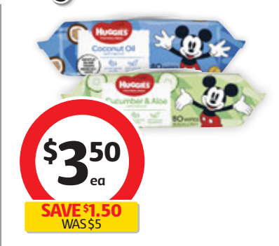
Huggies Cucumber & Aloe or Coconut Oil Baby Wipes 80 Pack $4.38 per 100 each