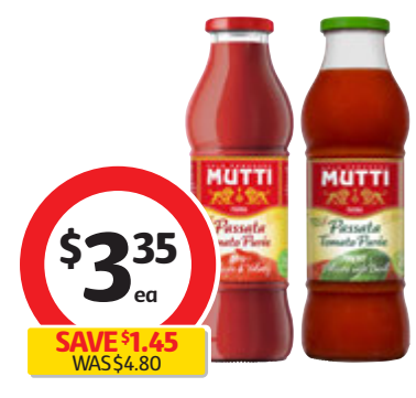
Mutti Passata 700g $0.48 per 100g