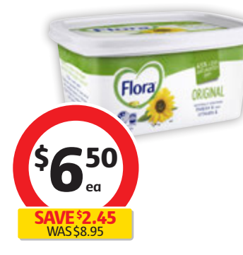
Flora Margarine 1kg $0.65 per 100g