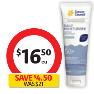
Cancer Council Daily Moisturiser Sunscreen Lotion SPF50+ 150mL^ $11.00 per 100mL