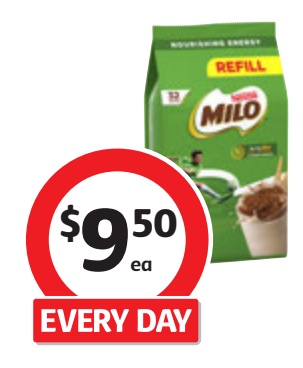
Nestlé Milo Softpack 650g $1.46 per 100g