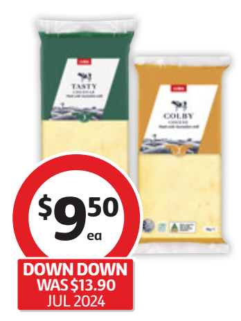
Coles Cheese Block 1kg $9.50 per kg

Bio Cheese Cheddar or Pizza Shred 200g $35.00 per kg