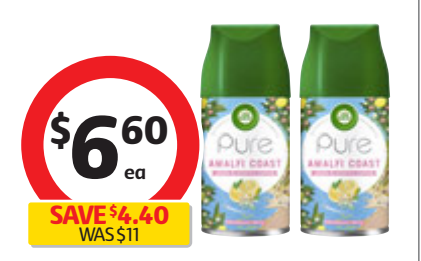
Air Wick Pure Auto Refill 159g $4.15 per 100g

Décor Adventurer Stainless Steel Bottle 1.2 Litre $16.75 per each