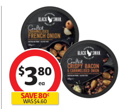
Black Swan Crafted Dip 170g $2.24 per 100g. On sale for 2 weeks