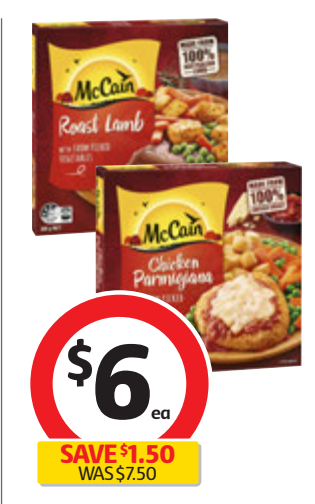
McCain Red Box Plated Frozen Meal 320g $1.88 per 100g