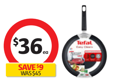
Tefal Easy Clean Frypan 30cm