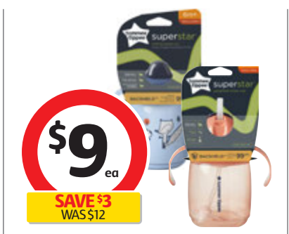
Tommee Tippee Superstar Weighted Straw Cup or Training Sippee Cup 6 Months+ 1 Each 2nd week on sale