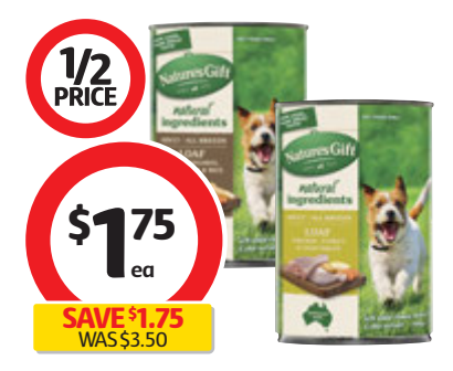
Nature's Gift Dog Food 700g $0.25 per 100g. On sale for 2 weeks