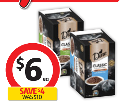
Dine Daily Cat Food 7x85g $1.01 per 100g