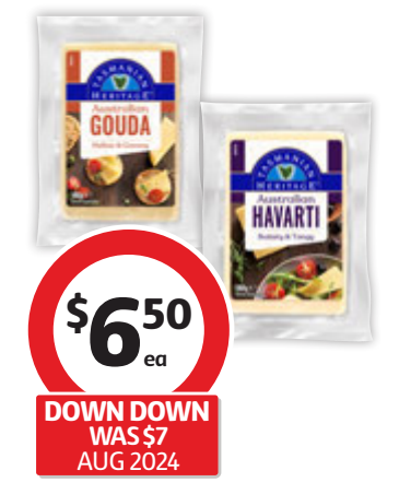
Tasmanian Heritage Cheese Wedge 180g $36.11 per kg