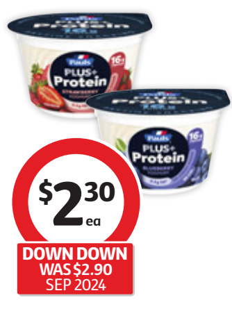
Pauls Plus Protein Yoghurt Blueberry or Strawberry 160g $1.44 per 100g

Danone Activia Yoghurt 4x125g $0.90 per 100g