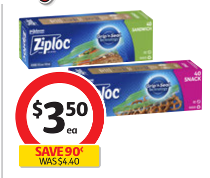
Ziploc Sandwich or Snack Bags 40 Pack $0.09 per each. 2nd week on sale