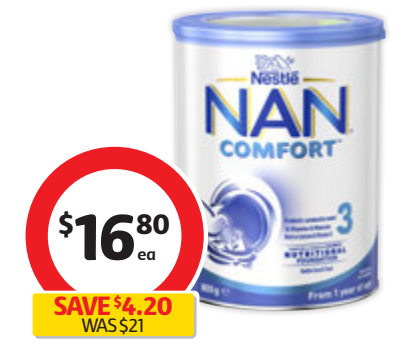
Nestlé Nan Comfort Stage 3 Milk Drink 800g $2.10 per 100g