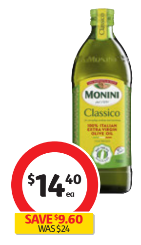
Monini Extra Virgin Olive Oil 750mL $1.92 per 100mL