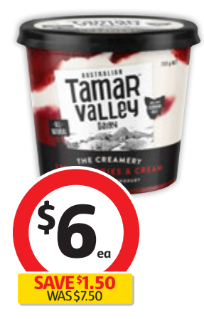
Tamar Valley Dairy The Creamery Yoghurt 700g $0.86 per 100g. Excludes Vanilla Bean