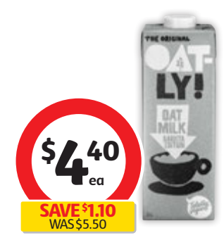
Oatly Barista Oat Milk 1 Litre $4.40 per litre