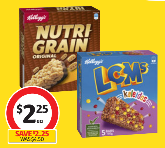
Kellogg's LCMs or Nutri Grain 5 Pack 100g-110g