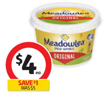
MeadowLea Dairy 500g $0.80 per 100g. On sale for 2 weeks