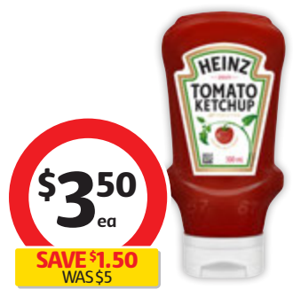
Heinz Tomato Ketchup 500mL $0.70 per 100mL

Don Skinless Footy Franks 435g $13.79 per kg