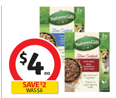
Nature's Gift Slow Cooked Dog Food 2x220g $0.91 per 100g. From the chilled pet food fridge