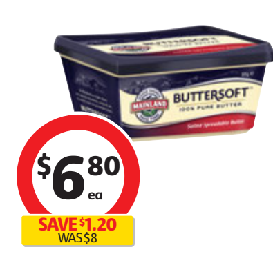
Mainland Buttersoft 375g $1.81 per 100g