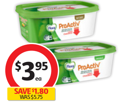
Flora ProActiv 250g $1.58 per 100g