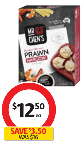
Mr Chen's Prawn Hargow 700g $1.79 per 100g. 2nd week on sale

Herbert Adams Slow Cooked Beef Pies 2 Pack 400g-420g