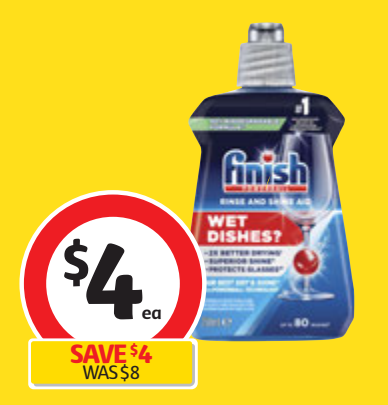
Finish Rinse & Shine Aid 250mL $1.60 per 100mL