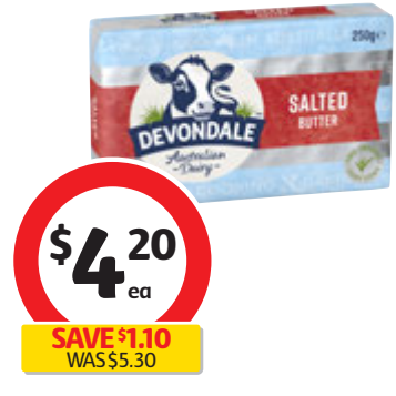
Devondale Butter 250g $1.68 per 100g