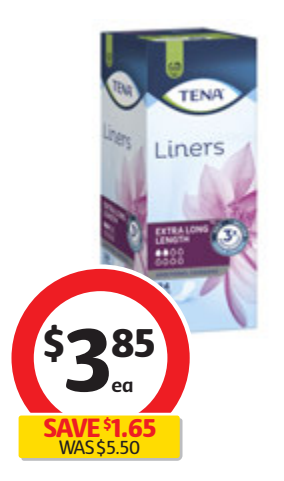
Tena Continence Extra Long Liners 24 Pack $0.16 per each