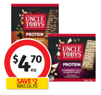
Uncle Tobys Protein Muesli Bars 175g $2.69 per 100g

Australia's Own Organic Almond Milk 1 Litre $2.30 per litre