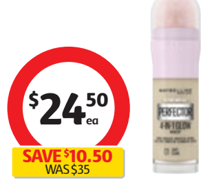
Maybelline 4-In-1 Glow Makeup 20mL $12.25 per 10mL