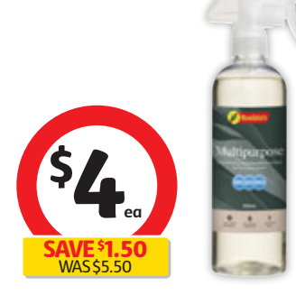
Bosistos Multipurpose Cleaner 500mL $0.80 per 100mL