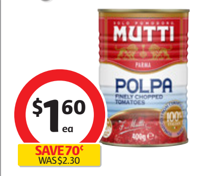
Mutti Polpa Tomatoes 400g $4.00 per kg