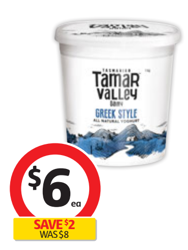
Tamar Valley Dairy Greek Style Yoghurt 1kg $0.60 per 100g

Dairy Farmers Thick & Creamy Yoghurt 140g or 150g