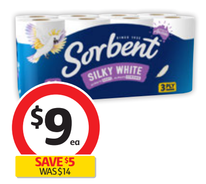
Sorbent 3-Ply Silky White Toilet Tissue 16 Pack $0.31 per 100 sheets