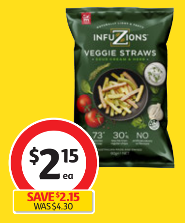
Infuzions Veggie Straws 90g $2.39 per 100g