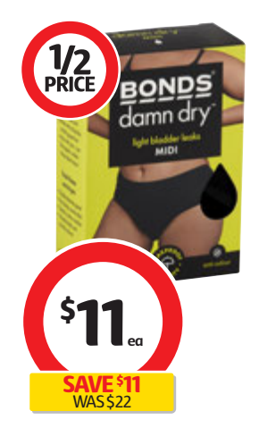
Bonds Women's Damn Dry Midi Underwear 1 Pack