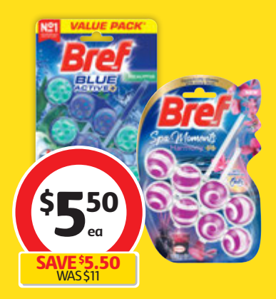
Bref Toilet Rimblock Twin Pack 100g $5.50 per 100g