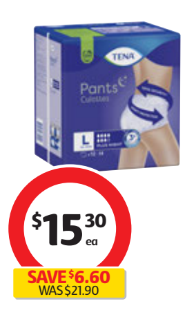
Tena Plus Night Pants 12 Pack $1.28 per each