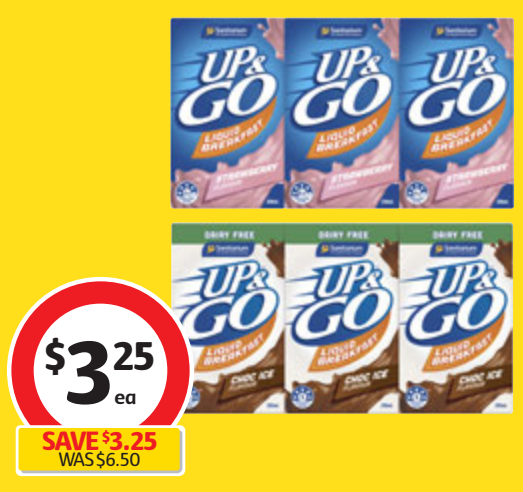
Sanitarium Up & Go Liquid Breakfast 3x250mL $4.33 per litre