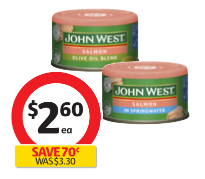
John West Salmon Tempters 95g $27.37 per kg