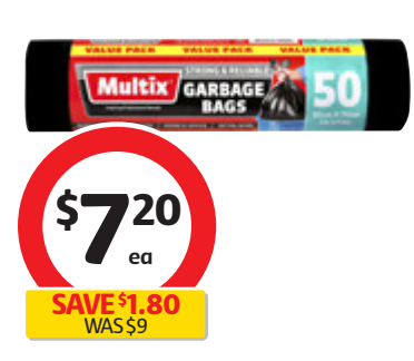
Multix Strong & Reliable Garbage Bags 50 Pack $0.14 per each