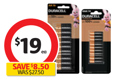
Duracell Coppertop Batteries AA 16 Pack or AAA 14 Pack