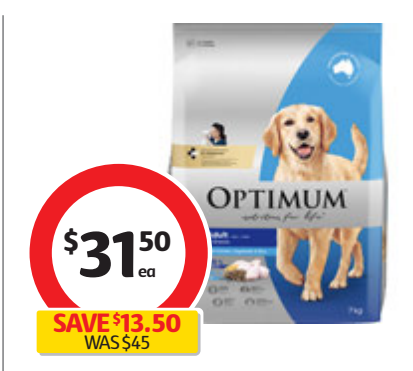
Optimum Dry Dog Food 7kg $0.45 per 100g