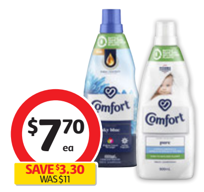
Comfort Fabric Conditioner 900mL $8.56 per litre

Glen 20 Disinfectant Spray 300g $2.07 per 100g