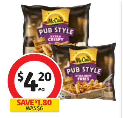
McCain Pub Style Fries 750g $5.60 per kg 9