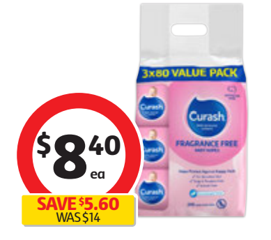
Curash Fragrance Free Sensitive Skin Baby Wipes 240 Pack $3.50 per 100 each