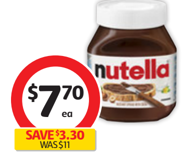
Nutella Hazelnut Chocolate Spread 750g $1.03 per 100g