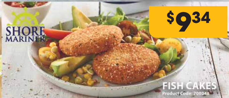
FISH CAKES Product Code: 708048