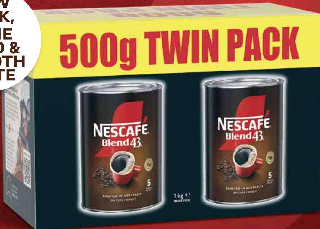
Nescafé Blend43 Twinpack 2 x 500g Item No. 51284