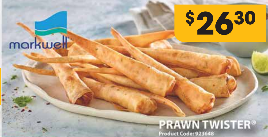
PRAWN TWISTER® Product Code: 923648