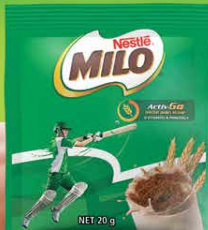
Milo Single Serve 100 x 20g Item No. 611974