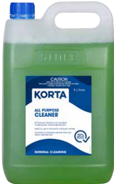
Korta All Purpose Cleaner 5 Litre