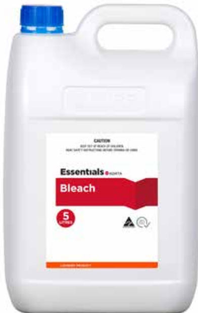
Essentials By Korta Bleach 5 Litre