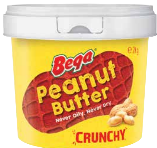
Bega Crunchy Peanut Butter 2kg