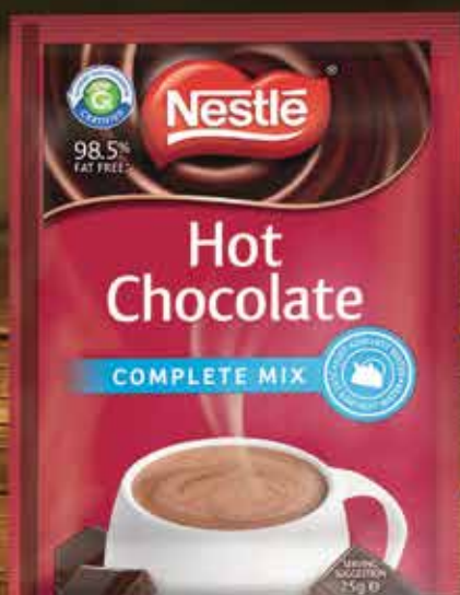
Hot Chocolate Single Serve 100 x 25g Item No. 434584