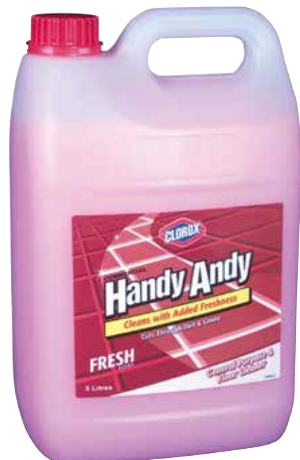
Handy Andy Pink Surface Cleaner 5 Litre