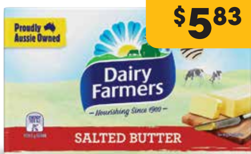
Dairy Farmers Salted Butter 500g Campbells Code: 497082