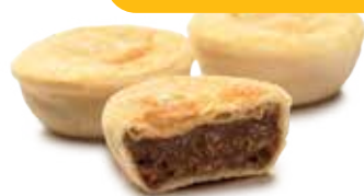
Party Pies 12s Item No. 199621