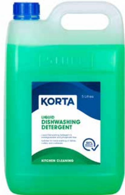
Korta Liquid Dishwashing Detergent 5 Litres