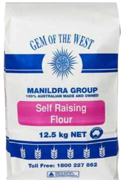
Gem Of The West Four Self Raising 12.5kg Item No. 266203 Per Unit