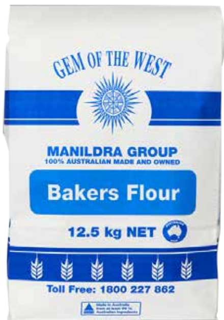
Gem Of The West Bakers Flour 12.5kg Item No. 266130 Per Unit