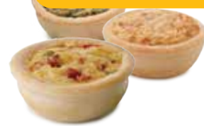
Party Quiches 72s Item No. 176898

For more information or to place an order, contact your Campbells Sales Representative or local Campbells branch. PATTIESFOODSERVICE.COM.AU