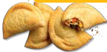
Party Pasties 12s Item No. 166767