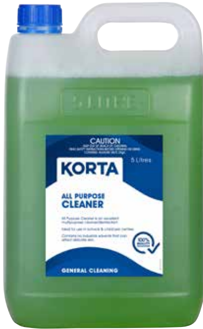
Korta All Purpose Cleaner 5 Litre