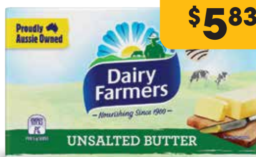
Dairy Farmers Unsalted Butter 500g Campbells Code: 497121