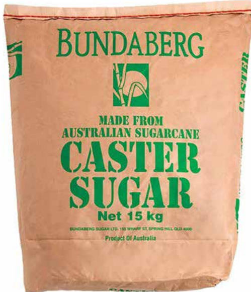
Bundaberg Caster Sugar 15kg Item No. 619980 Per Unit