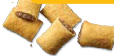
Party Rolls 12s Item No. 167925