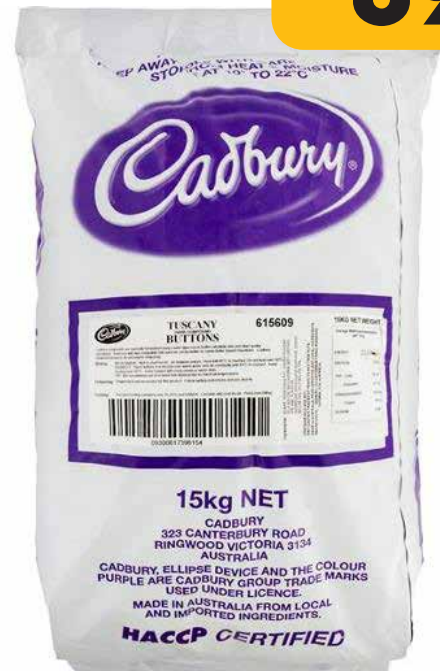
Cadbury Dark Tuscany Buttons 15kg Item No. 004321 Per Unit