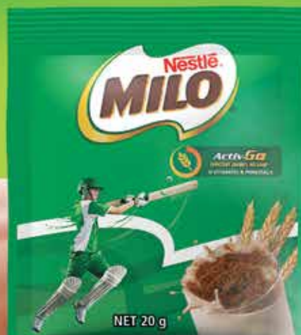
Milo Single Serve 100 x 20g Item No. 611974