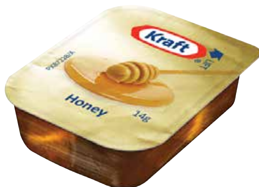
Kraft Honey Portions 50 x 13.6g