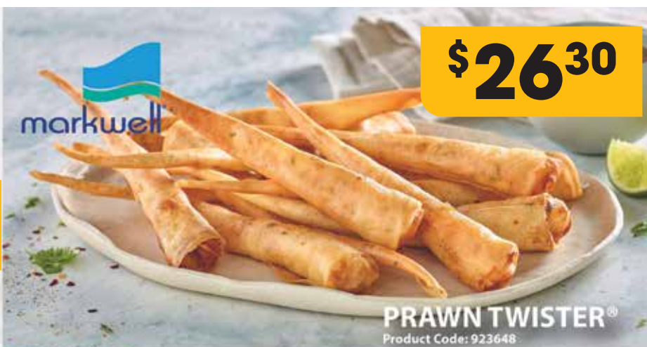
PRAWN TWISTER® Product Code: 923648