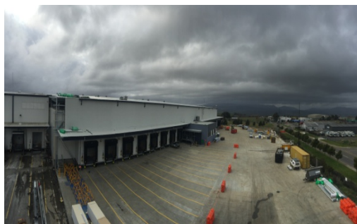
TC Despatch dock at TasRDC