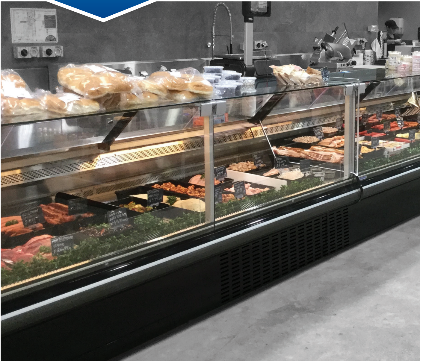
Picture shows standard bumper