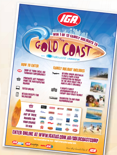
A4 & A3 Info Shelf Posters

You will receive these as part of your competition pack.