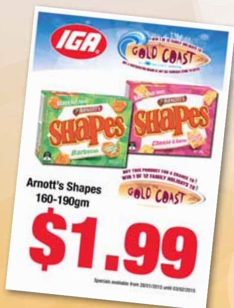
A4 Poster for eligible Brands

We've prepared a high impact POS kit for you!