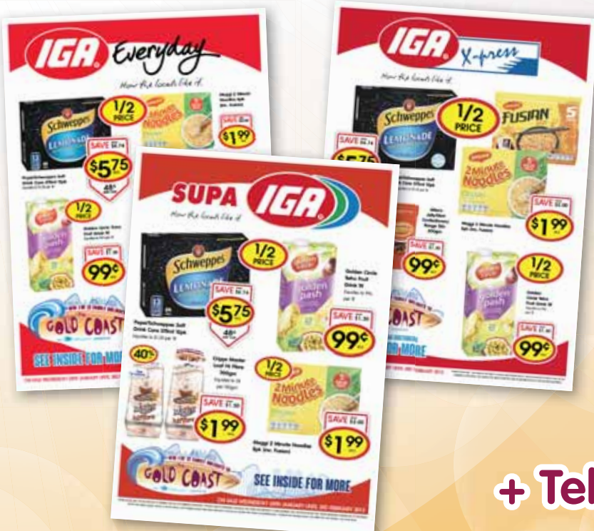
Catalogue front page