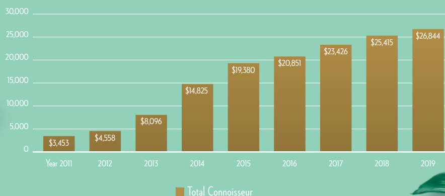
Total Connoisseur Dollars (000) - AU Independents scan

*Source: "Interest in Veganism is surging", The Economist, Jan 29th 2020.