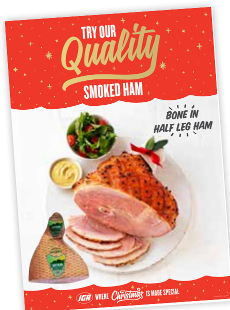
HAM ORDERING POSTER

All stores should already have received the Christmas Ham and Trading Hours Posters.