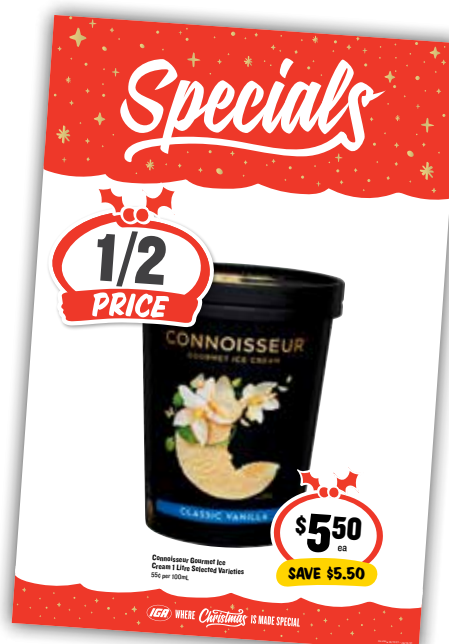
CHRISTMAS PRODUCT AND PRICE POSTERS

Stores will receive these in their POS packs or they are available to download online at: igatas.com.au/merchandise