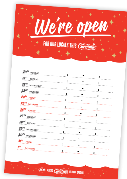
CHRISTMAS TRADING HOURS

Shoppers will need to know you have a great value Christmas ham and this is the best way to show them you have it available in store.