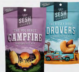
JC's Sesh Snacks 115/130g