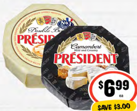
President Cheese 200g $34.95 per 1kg