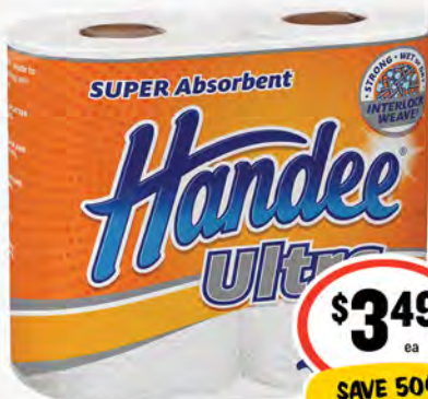
Handee Ultra Paper Towel 2pk $2.91 per 100ea