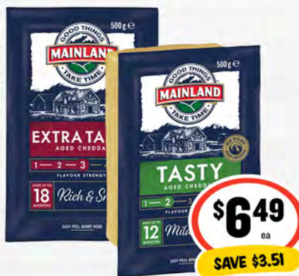
Mainland Cheese Block 400/500g