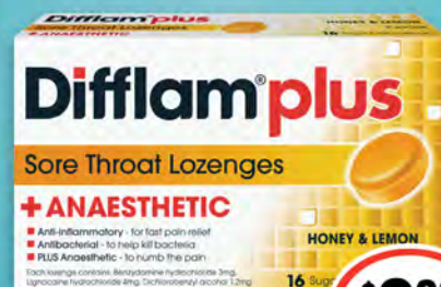
Difflam Plus Anaesthetic 16s 44¢ per tea