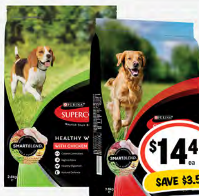
Supercoat Dog Food 2.6/2.8kg