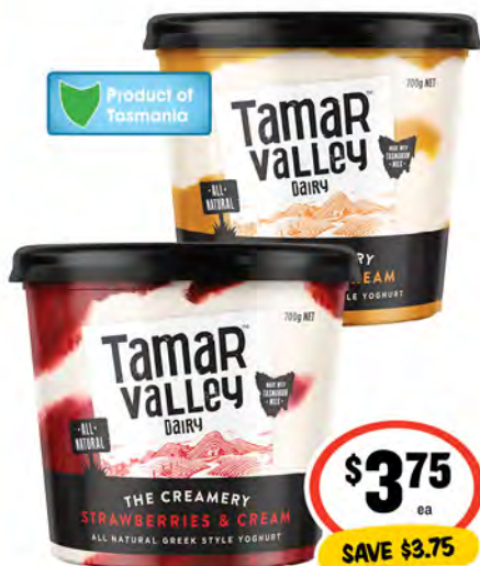
Tamar Valley Yoghurt 700g 54¢ per 100g