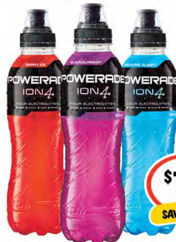
Powerade Sports Drink 600mL $3.32 per 1L