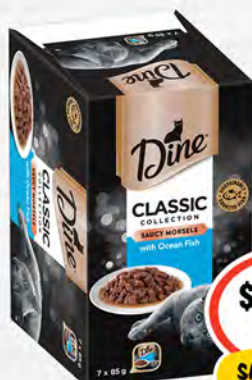
Dine Cat Food 7x85g $1.17 per 100g