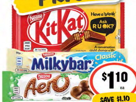
Nestle Medium Chocolate Bars 35-55g