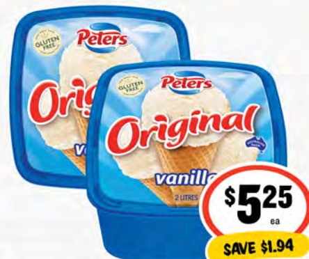
Peters Original Ice Cream 2L 26¢ per 100mL