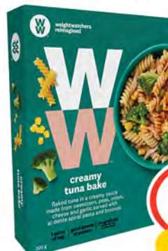
Weight Watchers Frozen Meals 300-370g