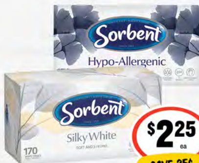
Sorbent Facial Tissues 170s $1.32 per 100ea