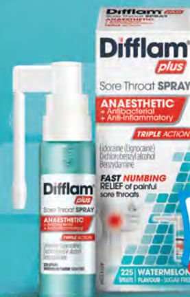
Difflam Plus Anaesthetic Throat Spray 30mL $56.63 per 100mL