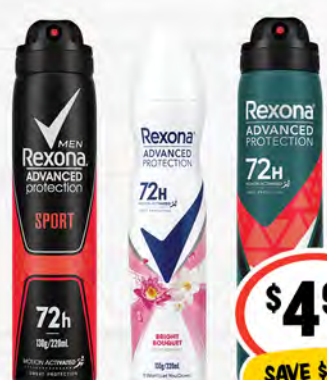
Rexona Advanced Antiperspirant 220mL $2.27 per 100mL