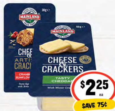
Mainland On the Go Cheese & Crackers 50g/Artisan 36/38g