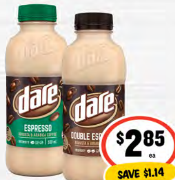
Dare Iced Coffee 500mL $5.70 per 1L