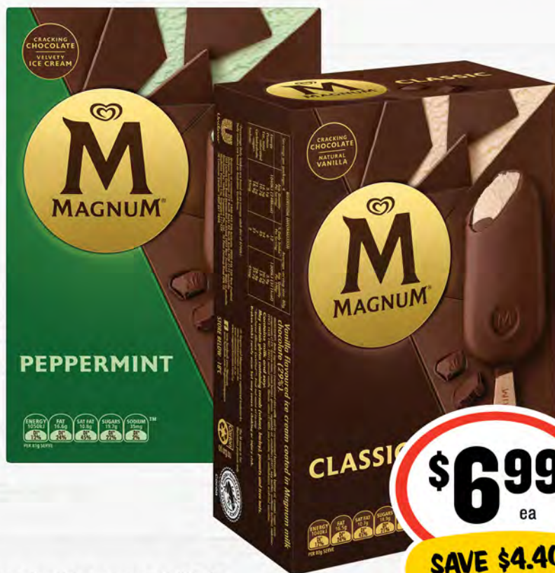
Streets Magnum 4/6pk