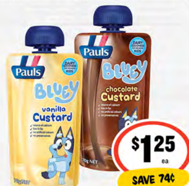
Pauls Custard 70g $1.79 per 100g