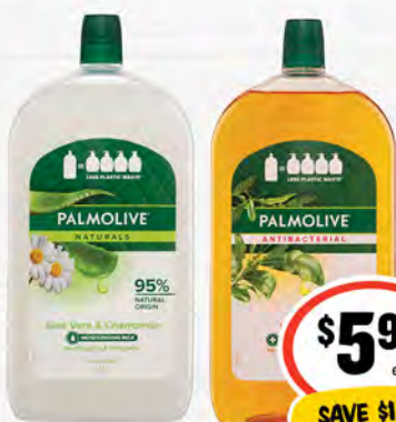
Palmolive Liquid Hand Wash 1L 60¢ per 100mL