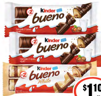
Kinder Bueno 39/43g