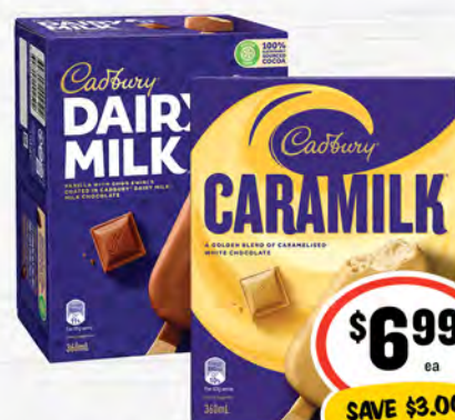
Nestle Kit Kat/Cadbury Ice Cream Sticks 4pk