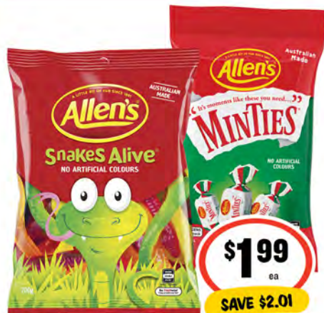
Allen's Jelly/Mint Confectionery Range 140-200g