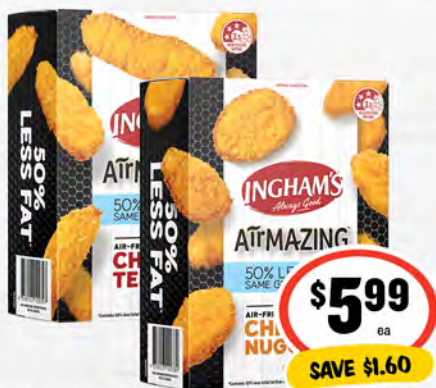
Ingham's Airmazing Nuggets/Tenders 350/400g