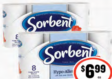
Sorbent Toilet Tissue Hypo-Allergenic 8pk 49¢ per 100sh