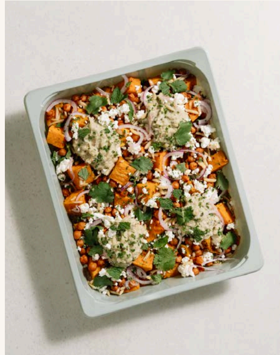
ROAST PUMPKIN AND CHICKPEA SALAD