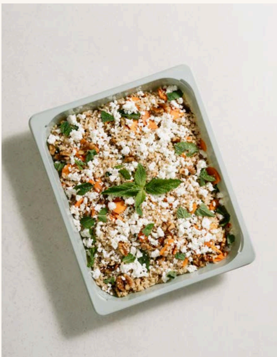
ROAST CARROT AND BROWNRICE SALAD