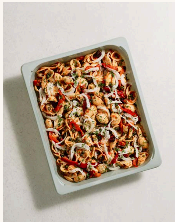
FUSILLI PASTA WITH TOMATO PESTO DRESSING