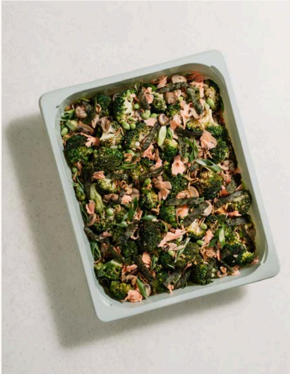
CHARRED BROCCOLI AND SOBA NOODLE SALAD