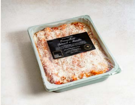
CANNELLONI SPINACH & RICOTTA