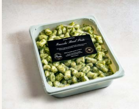
GNOCCHI BASIL PESTO PLANT BASED