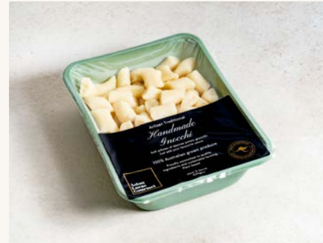
PLAIN GNOCCHI - 2.5KG PLANT BASED