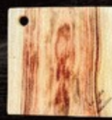
Item:SQC8 Size:300x300x30mm Weight:1.5KG