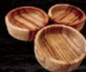
Item:HCB001 Size:90mm in diameterx28mm Weight:0.15KG