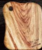
Item:PS004 Size:280x240x30mm Weight:0.8KG