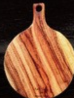
Item:PZL010 Size:310mm in diameter excluding handle X 30mm Weight:1.5KG