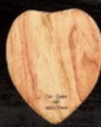
Item:CBH001 Size:240x295x30mm Weight:0.78KG