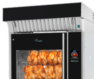
Ventless Hood (optional)