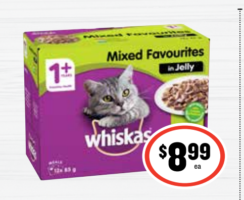
Whiskas Favourites Pouches 12x85g 88¢ per 100g