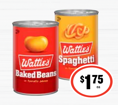
Wattie's Spaghetti/Baked Beans 420g