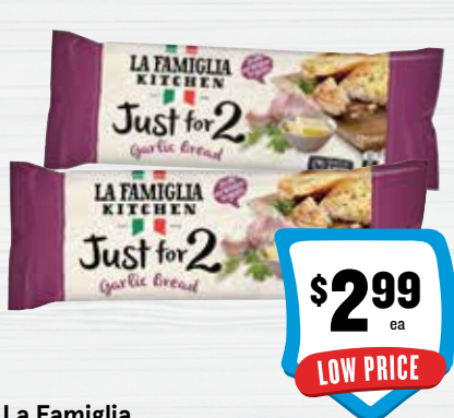
La Famiglia Just for 2 Garlic Bread 170g $1.76 per 100g