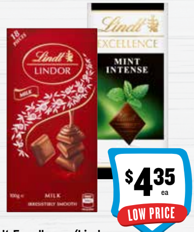
Lindt Excellence/Lindor Chocolate Block 100g (excl. 70%) $4.35 per 100g