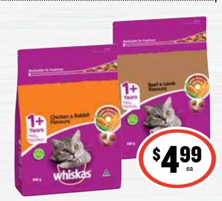
Whiskas Dry Cat Food 800g