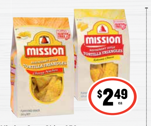
Mission Corn Chips 230g $1.08 per 100g