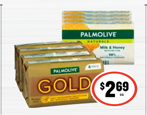
Palmolive Gold/Naturals Soap 4pk 75¢ per 100g