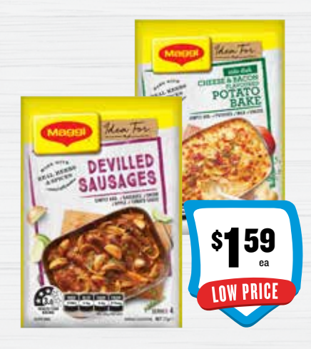
Maggi Recipe Base Sachets 21-43g