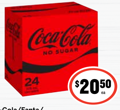
Coca-Cola/Fanta/ Sprite Soft Drink Cans 24x375mL $2.28 per 1L

Duck River Butter Pat 500g $1.20 per 100g