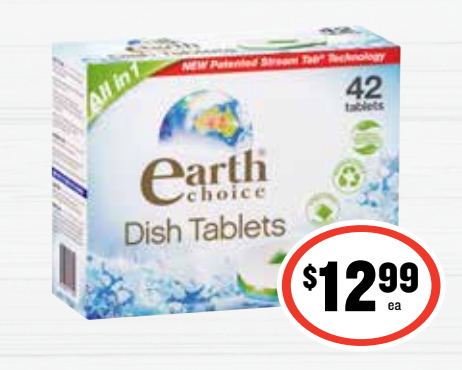
Earth Choice Dishwash Tablet 42s $1.93 per 100g