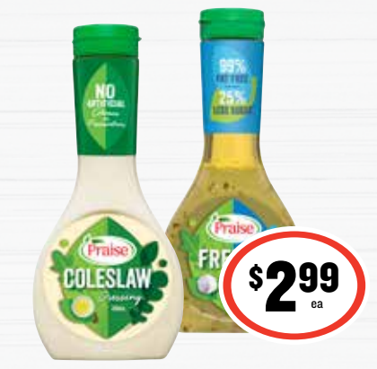
Praise Salad Dressing 330mL