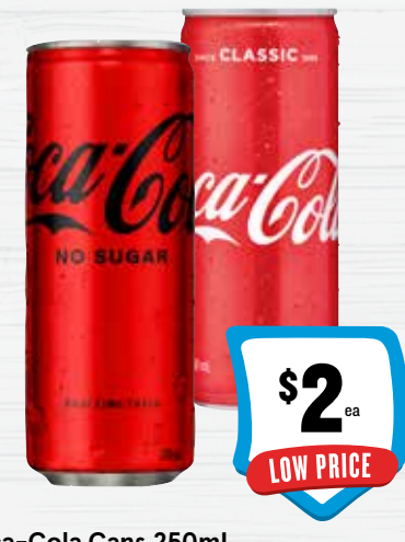
Coca-Cola Cans 250mL $8.00 per 1L