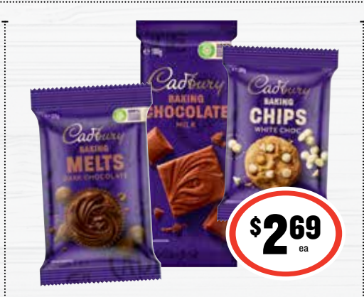
Cadbury Baking Blocks/ Chips/Melts/Buttons 150-225g

MasterFoods Squeezy Tomato/ BBQ Sauce 475/500mL