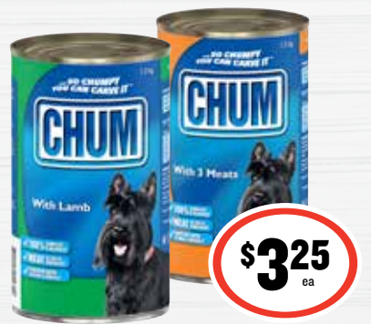
Chum Canned Dog Food 1.2kg