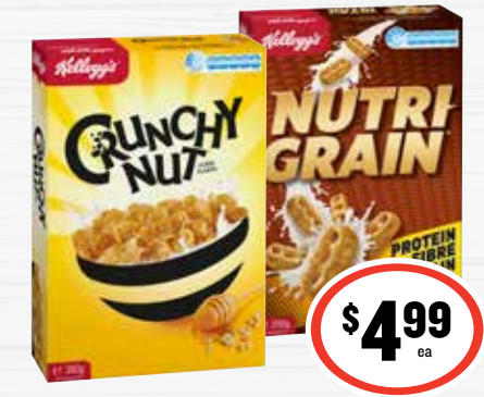
Kellogg's Crunchy Nut Corn Flakes/Special K/ Nutri-Grain/Sultana Bran 290-420g