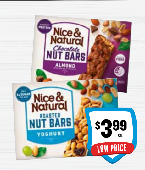
Nice & Natural Nut Bars 6pk