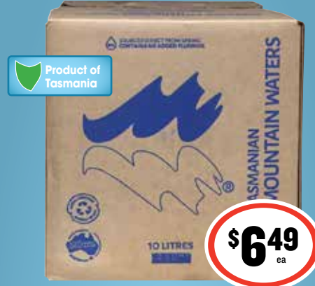
Tasmanian Mountain Spring Water 10L 65¢ per 1L