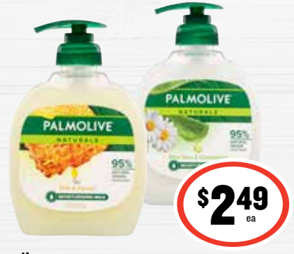
Palmolive Softwash Liquid Soap Pump 250mL $1.00 per 100mL