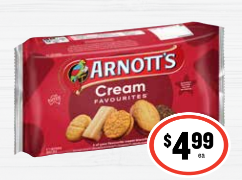
Arnott's Cream Favourites 500g $1.00 per 100g