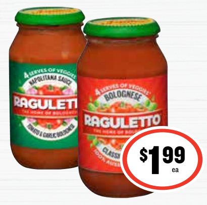
Raguletto Pasta Sauce 500g