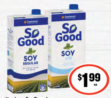
Sanitarium So Good UHT Reg/Lite Soy Milk 1L $1.99 per 1L