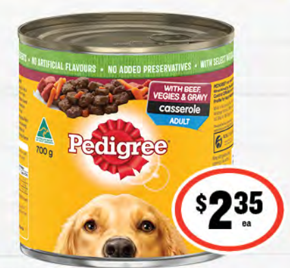
Pedigree Canned Dog Food 700g 34¢ per 100g