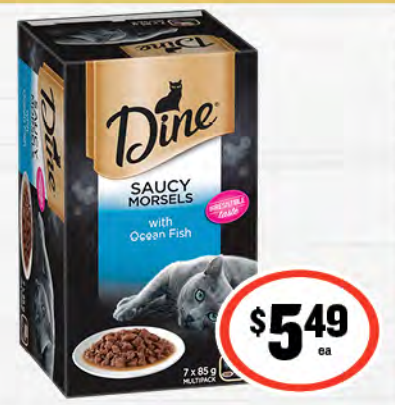
Dine Cat Food 85g 7pk 92¢ per 100g