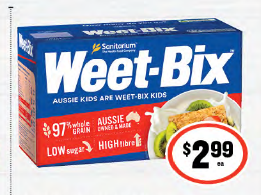
Sanitarium Weet-Bix 575g 52¢ per 100g