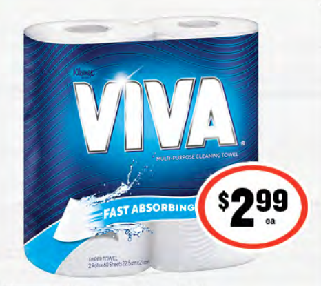
Kleenex Viva Paper Towel 2pk