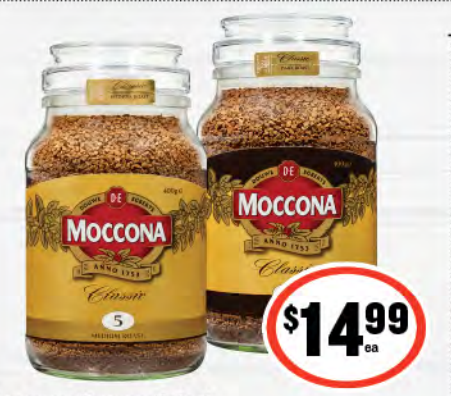
Moccona Freeze Dried Classic Coffee 400g $3.75 per 100g