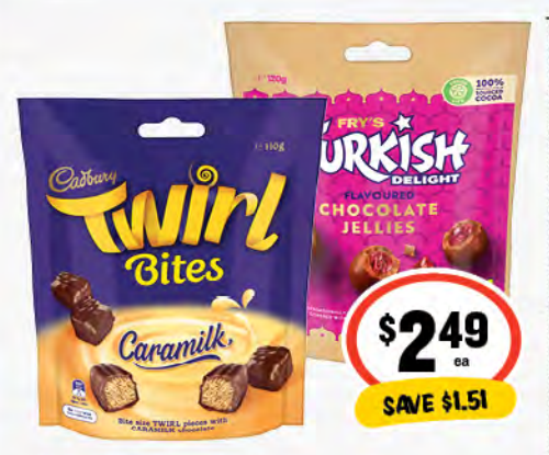
Cadbury Bites 110-150g