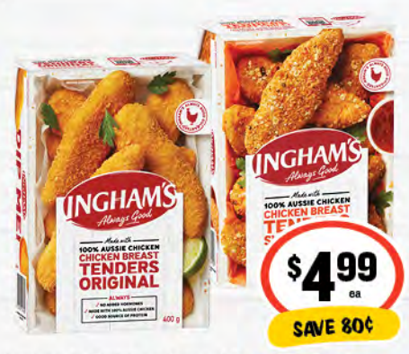
Ingham's Chicken Breast Tenders 400g $12.48 per 1kg