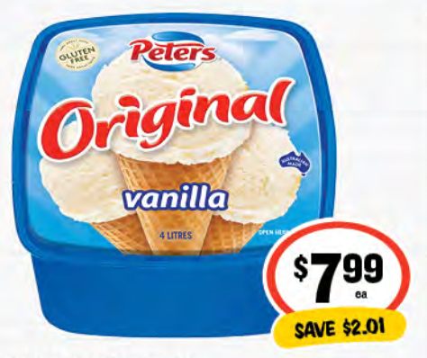
Peters Ice Cream 4L 20¢ per 100mL