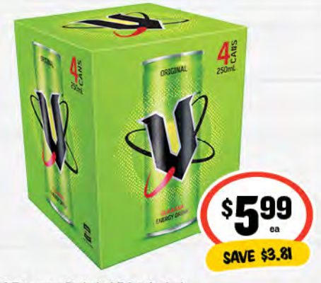
V Energy Drink 250mL 4pk $5.99 per 1L