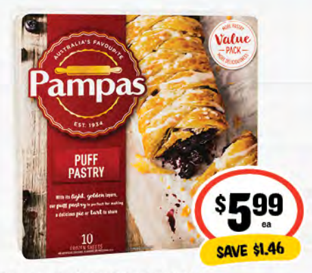
Pampas Bulk Puff Pastry 1.6kg 37¢ per 100g