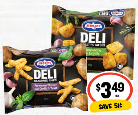
Birds Eye Deli Chips/Roast Potatoes 600g $5.82 per 1kg