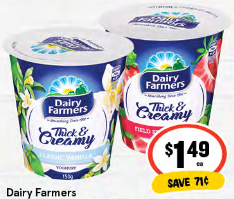
Thick & Creamy Yoghurt 150g 99¢ per 100g