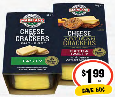
Mainland On the Go Cheese & Crackers 50g/Artisan 38g