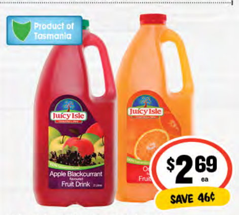
Juicy Isle Chilled Fruit Drink 2L $1.35 per 1L