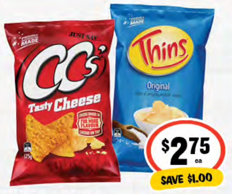
CC's Corn Chips/ Thins Potato Chips 110-175g