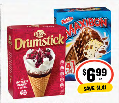
Peters Drumstick/Maxibon 4/6pk