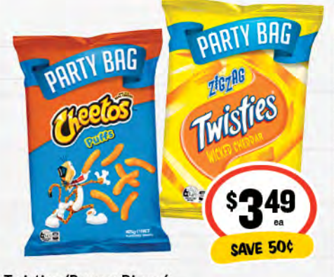
Twisties/Burger Rings/ Cheetos 125-270g