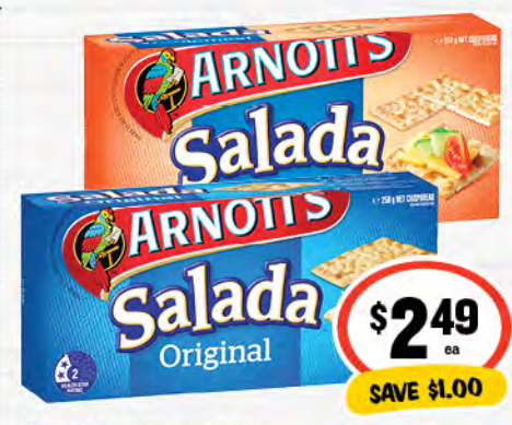
Arnott's Salada 250g $1.00 per 100g