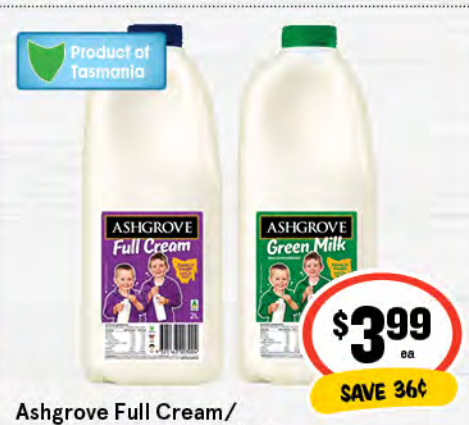
Ashgrove Full Cream/ Non Homogenised Milk 2L $2.00 per 1L