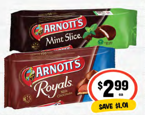
Arnott's Chocolate Biscuits 160-250g (excl. Tim Tam)