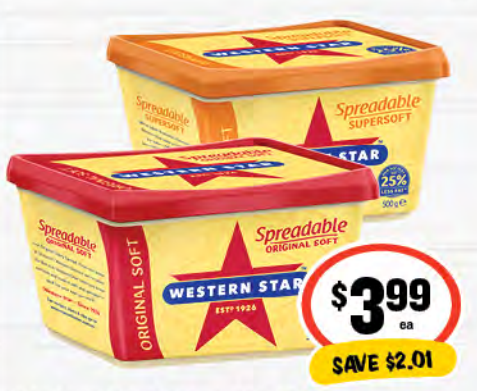
Western Star Spreadable 500g 80¢ per 100g