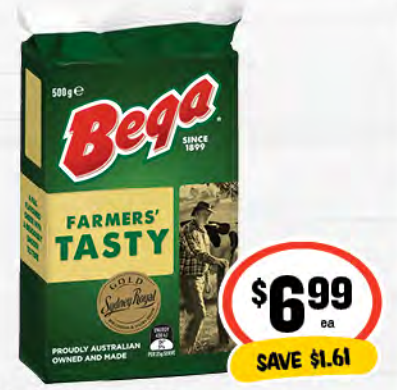
Bega Block Cheese 500g $13.98 per 1kg