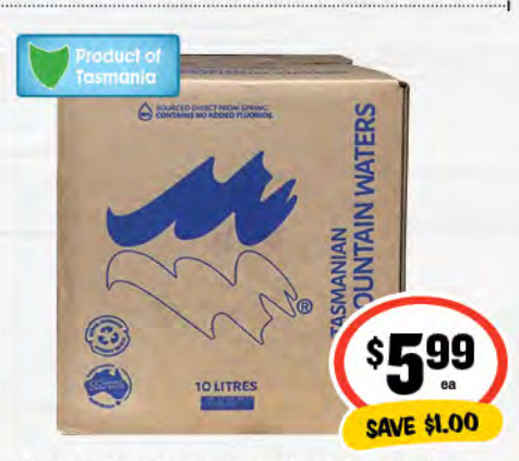
Tasmanian Mountain Spring Water 10L 60¢ per 1L