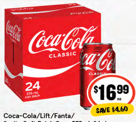
Coca-Cola/Lift/Fanta/ Sprite Soft Drink Cans 375mL 24pk $1.89 per 1L