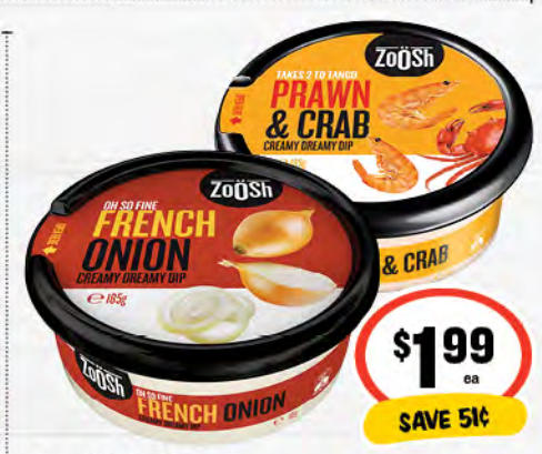
Zoosh Dip 185g $1.08 per 100g