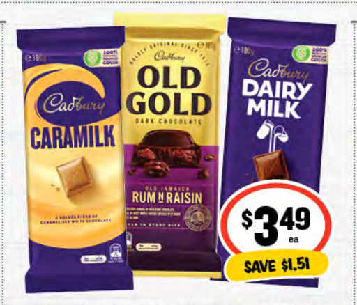
Cadbury Family Block Chocolate 160-190g