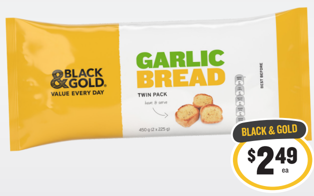
Black & Gold Garlic Bread 2pk 450g 55¢ per 100g