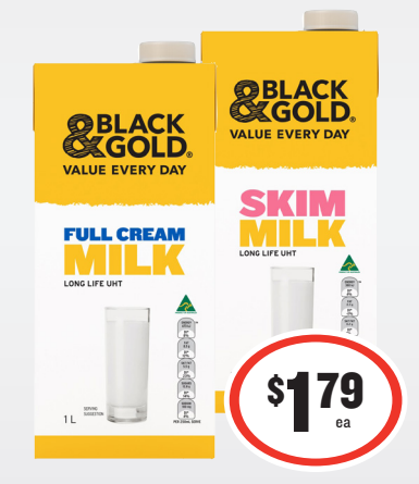
Black & Gold Longlife Milk 1L $1.79 per 1L