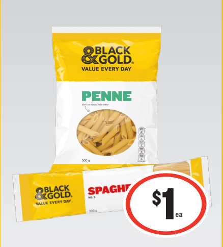
Black & Gold Pasta 500g 20¢ per 100g