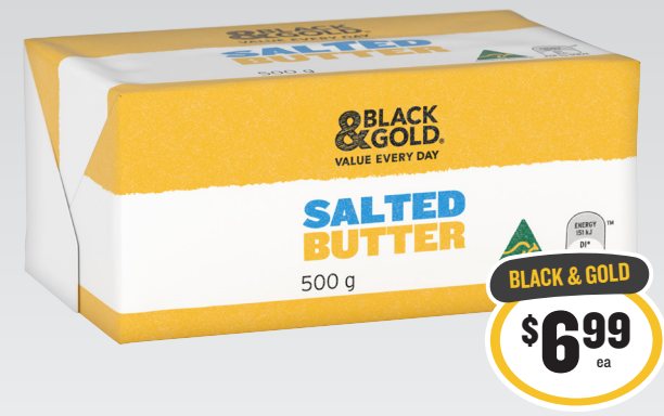
Black & Gold Salted Butter 500g $1.40 per 100g