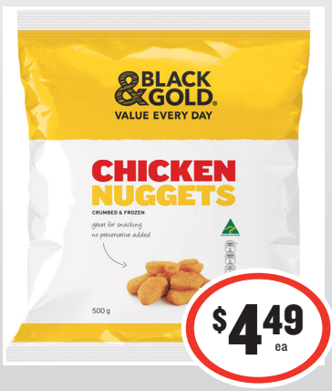
Black & Gold Chicken Nuggets 500g $8.98 per 1kg