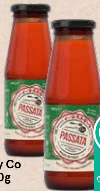
Community Co Passata 690g 39¢ per 100g