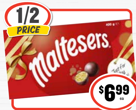
Maltesers Gift Box 360/400g