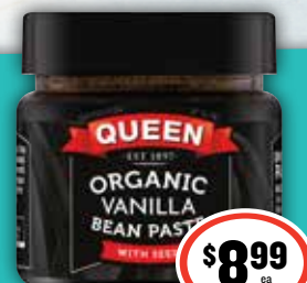
Queen Vanilla Bean Paste 65g $13.83 per 100g