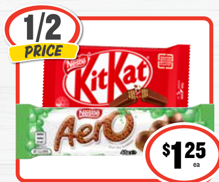
Nestle Medium Bars 35-55g