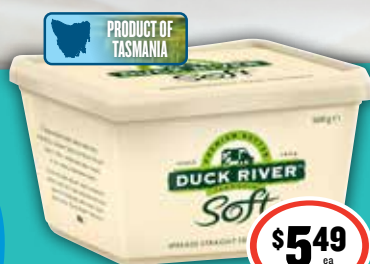
Duck River Soft Butter 500g $1.10 per 100g