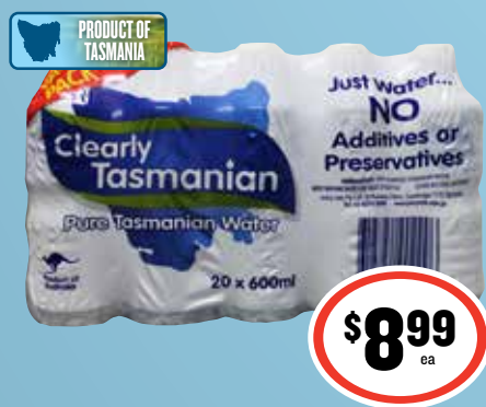
Clearly Tasmanian Water 20x600mL 75¢ per 1L