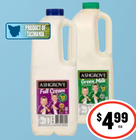
Ashgrove Full Cream/ Non Homogenised Milk 2L $2.50 per 1L