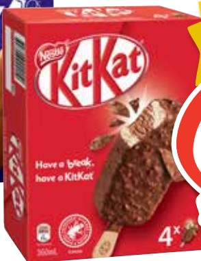
Oreo/Nestle Kit Kat/ Cadbury Ice Cream Sticks 4pk