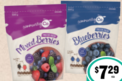
Community Co Frozen Fruit 500g $14.58 per 1kg