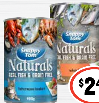
Snappy Tom Canned Cat Food 400g 62¢ per 100g