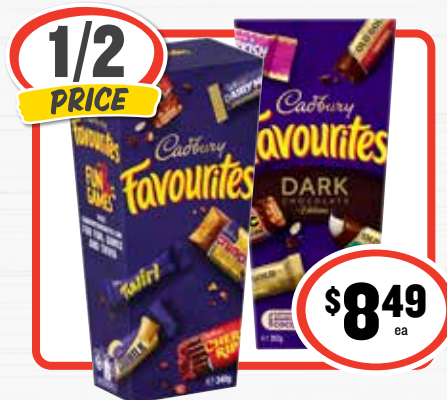
Cadbury Favourites 340/352g