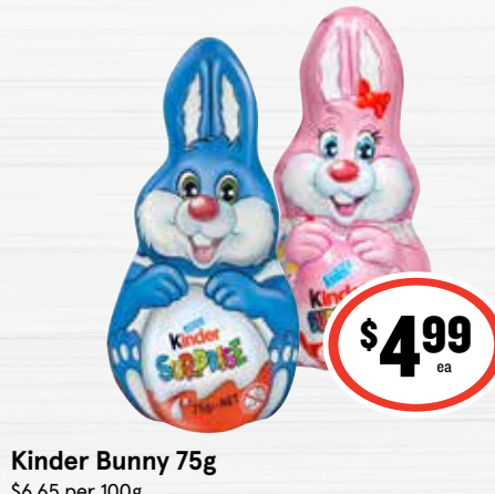
Kinder Bunny 75g $6.65 per 100g