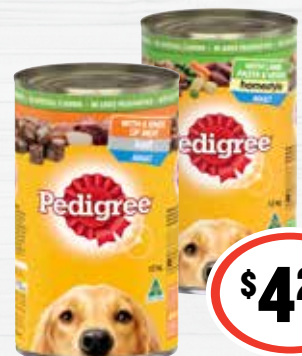
Pedigree Canned Dog Food 1.2kg 35¢ per 100g