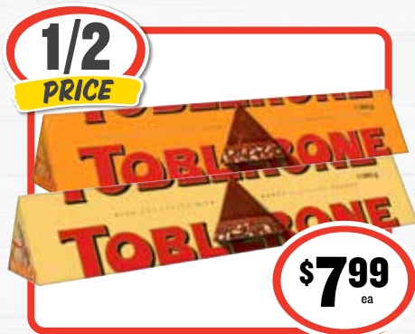
Toblerone Pralines 180g/Chocolate 360g