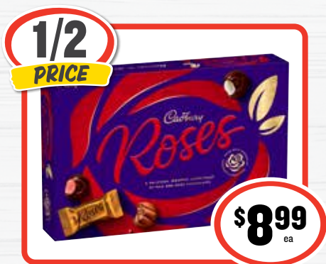
Cadbury Roses Chocolates 420g $2.14 per 100g