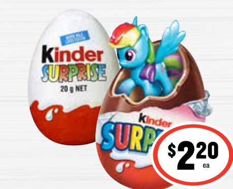
Kinder Surprise 20g $11.00 per 100g