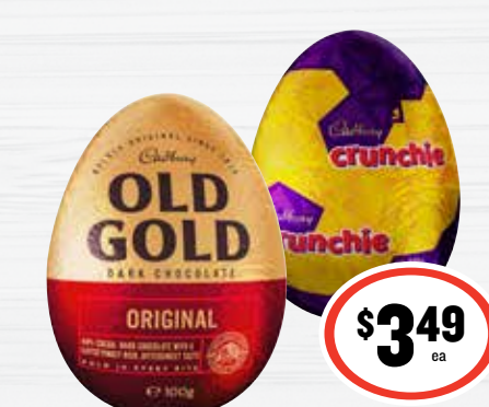
Cadbury Hollow Egg 100/110g