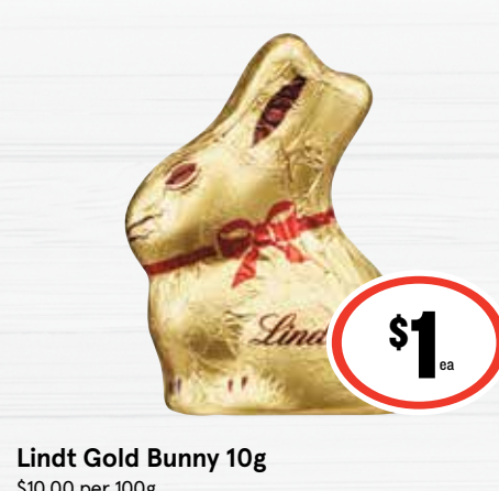
Lindt Gold Bunny 10g $10.00 per 100g