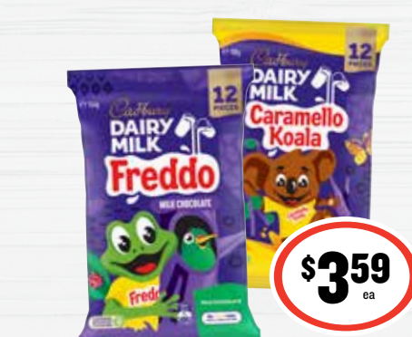
Cadbury Share Pack 144-180g