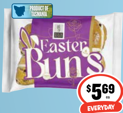
Cripps Four Roses Easter Buns 6pk $1.26 per 100g