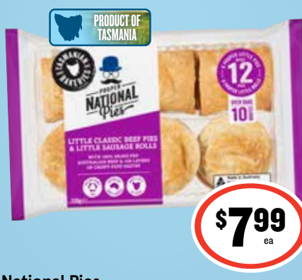
National Pies Party Pies/Sausage Rolls 12pk $1.11 per 100g