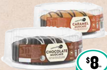
Community Co Mud Cake 600g $1.33 per 100g

JOIN US IN GIVING BACK TO YOUR LOCAL COMMUNITY