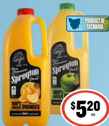
Spreyton Fresh Juice 2L $2.60 per 1L