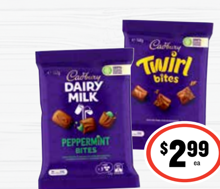
Cadbury Bites 110-150g