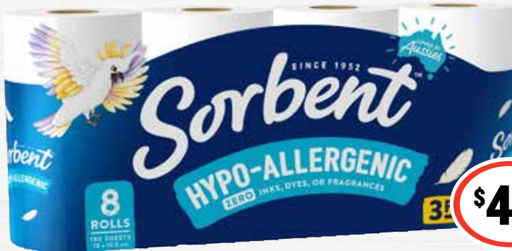
Sorbent Toilet Tissue Hypo-Allergenic 8pk 35¢ per 100sh