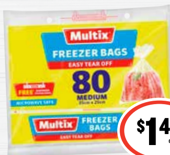
Multix Tear Off Freezer Bags 40-120pk