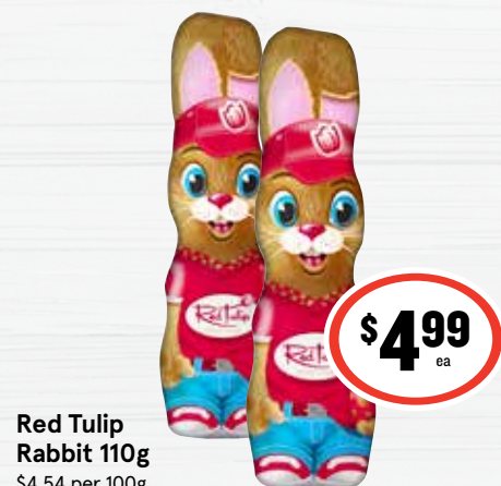
Red Tulip Rabbit 110g $4.54 per 100g