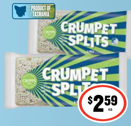
Cripps Crumpet Splits 6pk 61¢ per 100g