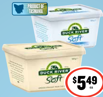
Duck River Soft Butter 500g $1.10 per 100g