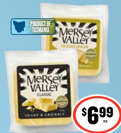
Mersey Valley Cheese 235g $29.74 per 1kg