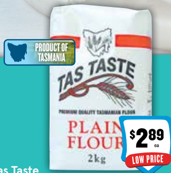
Tas Taste Plain/Self Raising Flour 2kg $1.45 per 1kg