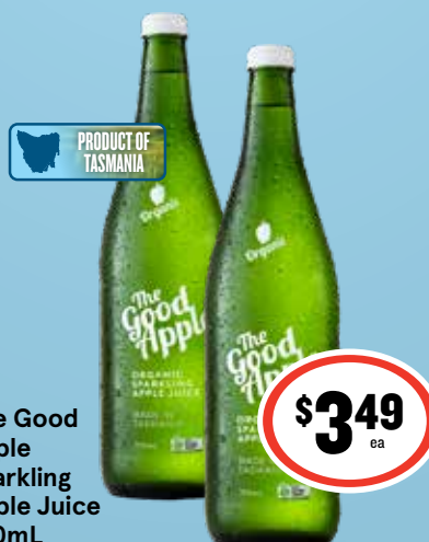
The Good Apple Sparkling Apple Juice 750mL $4.65 per 1L