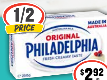
Philadelphia Cream Cheese Block 250g $11.68 per 1kg