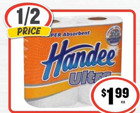
Handee Ultra Paper Towel 2pk $1.66 per 100ea