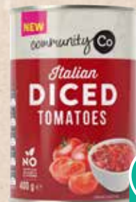
Community Co Diced Tomatoes 400g $4.75 per 1kg