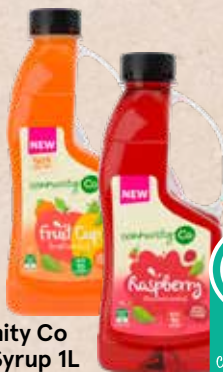
Community Co Cordial Syrup 1L $3.69 per 1L