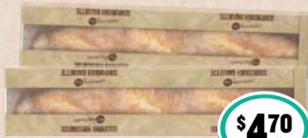
Community Co Baguette Sourdough 250g $1.88 per 100g