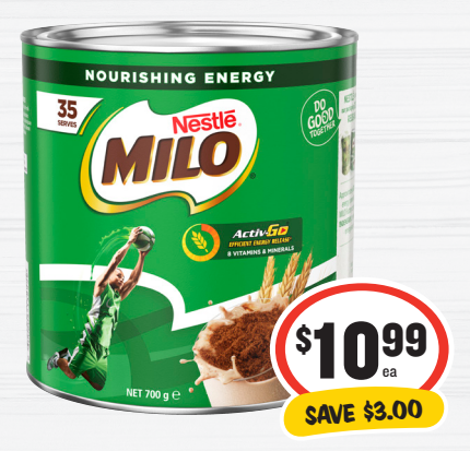
Nestle Milo 700g $1.57 per 100g