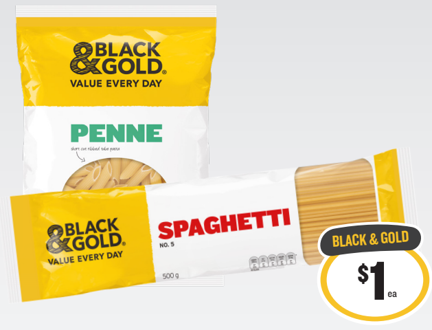
Black & Gold Pasta 500g