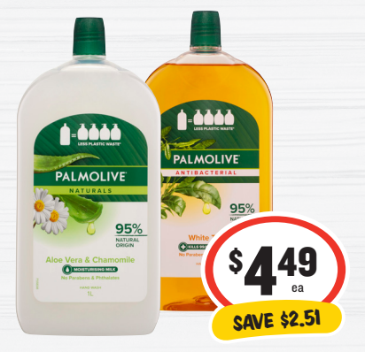
Palmolive Liquid Hand Wash 1L 45¢ per 100mL