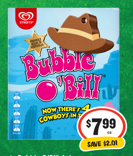
Streets Bubble O'Bill 4pk $1.98 per 100mL