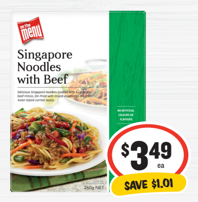
On the Menu Frozen Meal 260g $1.34 per 100g