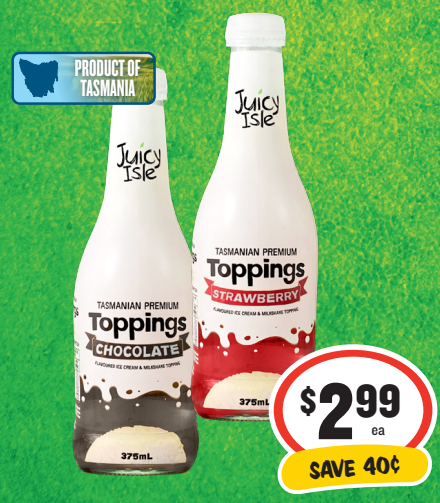
Juicy Isle Topping 375mL 80¢ per 100mL