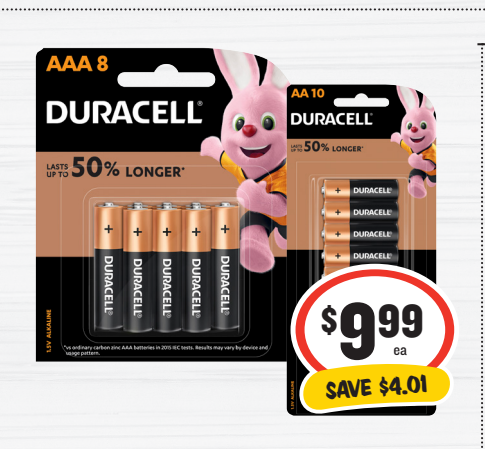
Duracell Batteries AA 10pk/AAA 8pk