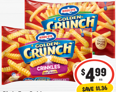
Birds Eye Golden Crunch Chips/Wedges 900g $5.54 per 1kg