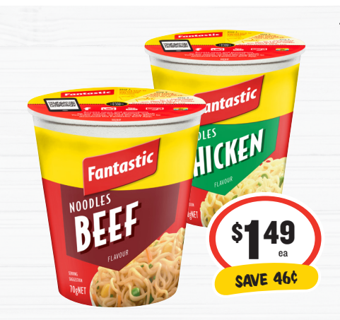
Fantastic Noodles Cup/Bowl 45-85g