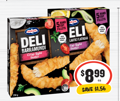
Birds Eye Deli Frozen Fish 225/250g