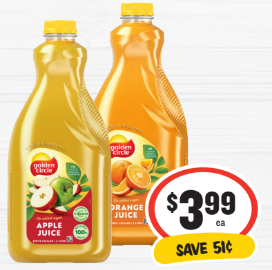
Golden Circle Long Life Juice 2L $2.00 per 1L