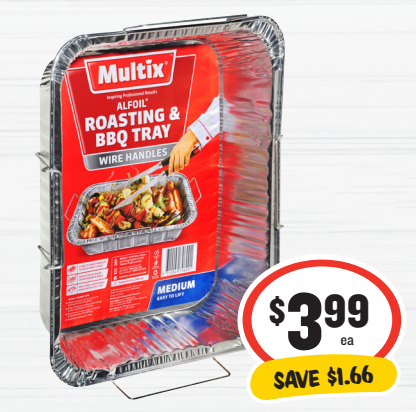
Multix Alfoil Medium Roast Tray with Handles