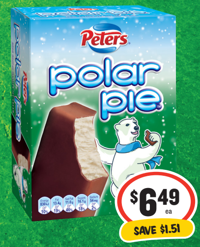
Peters Polar Pies 6pk $1.18 per 100mL