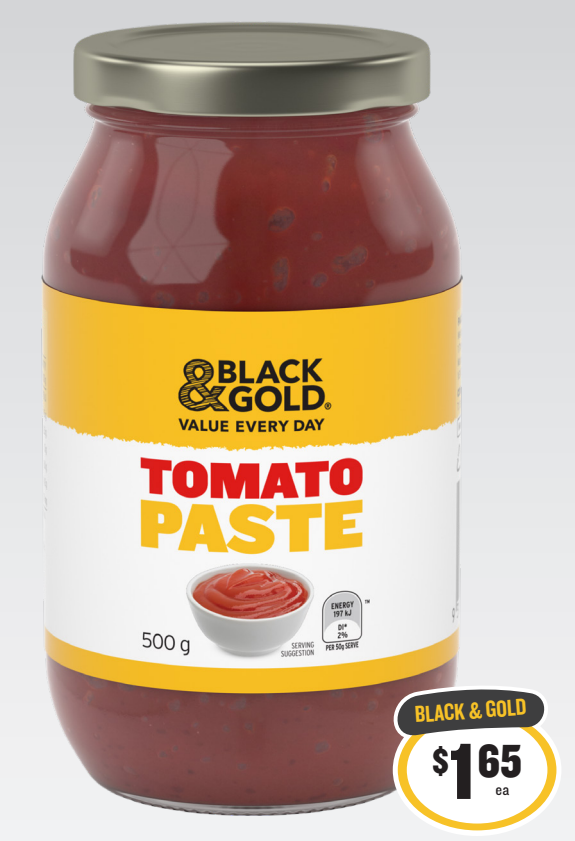
Black & Gold Tomato Paste 500g