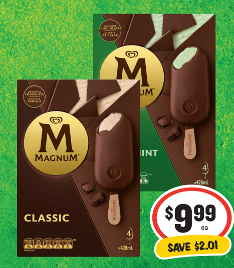
Streets Magnum 4/6pk