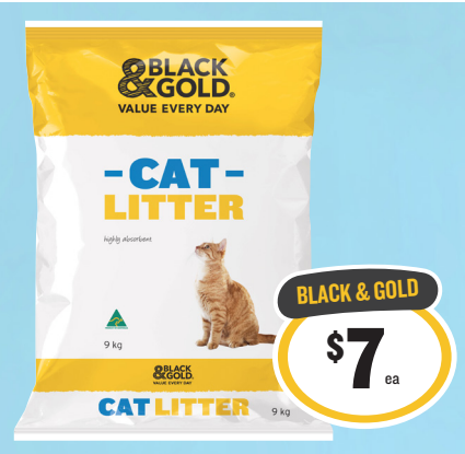
Black & Gold Cat Litter 9kg