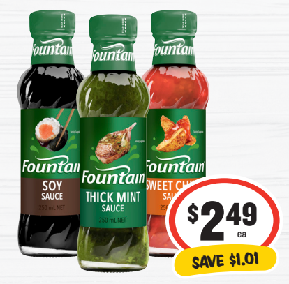
Fountain Specialty/Mint Sauce 250mL $1.00 per 100mL