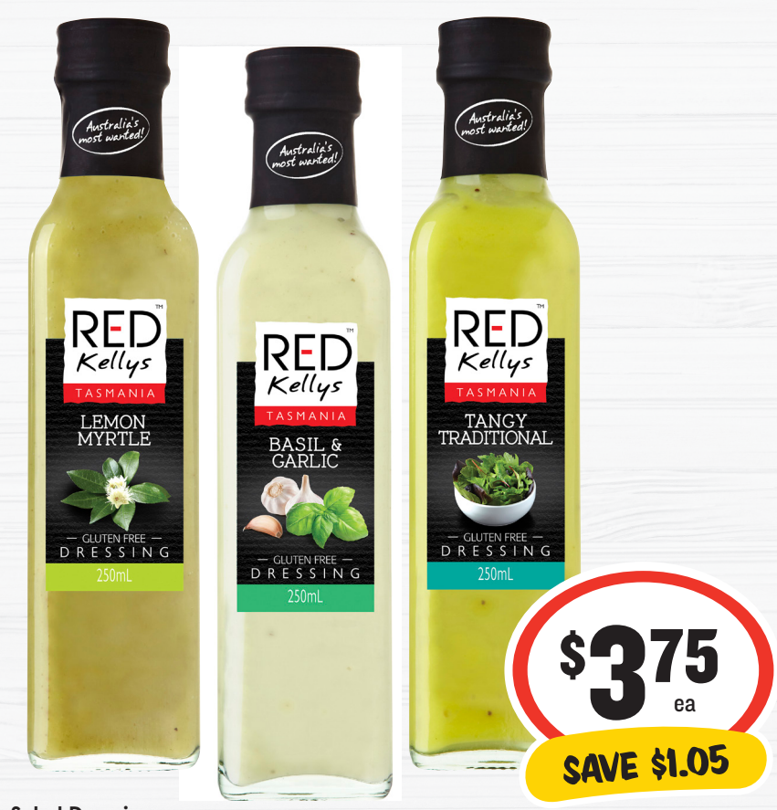
Red Kellys Salad Dressing 250mL (excl. Balsamic) $1.50 per 100mL