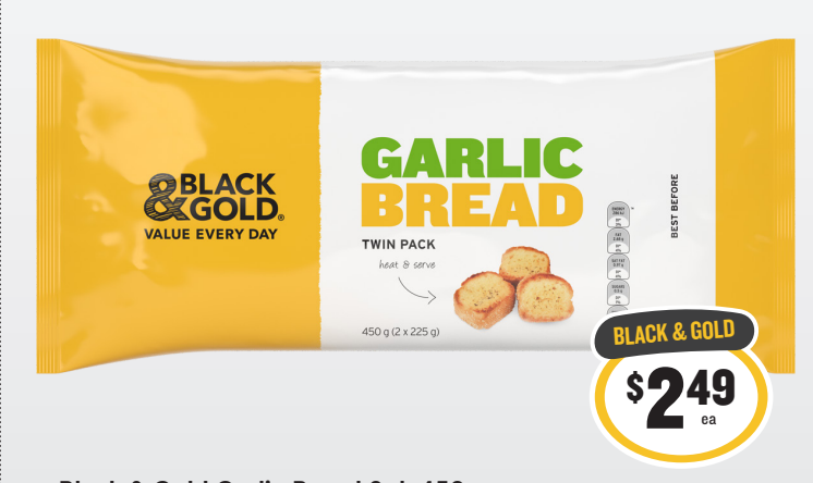
Black & Gold Garlic Bread 2pk 450g