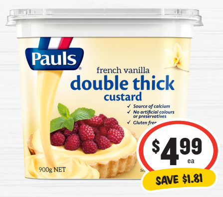
Pauls Double Thick Custard 900g 55¢ per 100g

Duck River Butter Pat 250g $1.80 per 100g