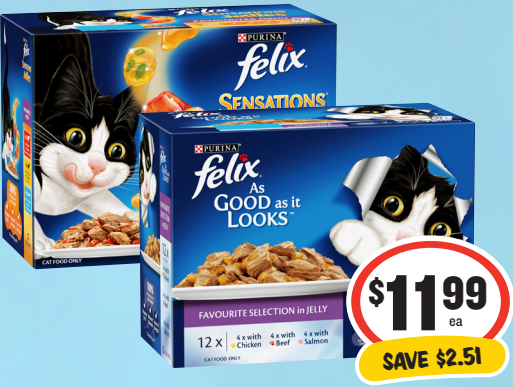
Felix Cat Food 12pk