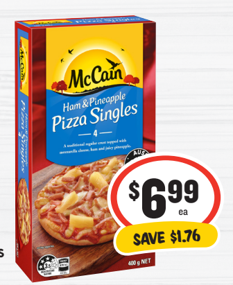
Pizza Singles 380/400g $1.75 per 100g