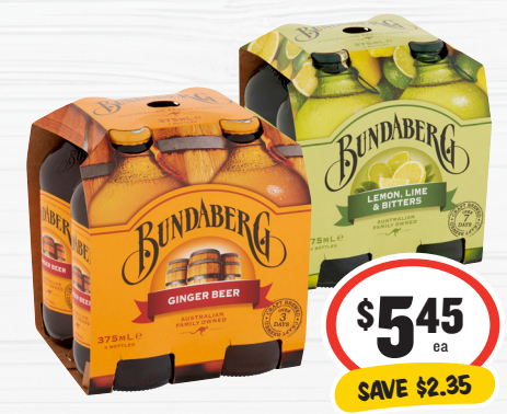
Bundaberg Soft Drink 4x375mL $3.63 per 1L

Coca-Cola/Fanta/Sprite/ Mt Franklin Sparkling Water 10x375mL $2.93 per 1L