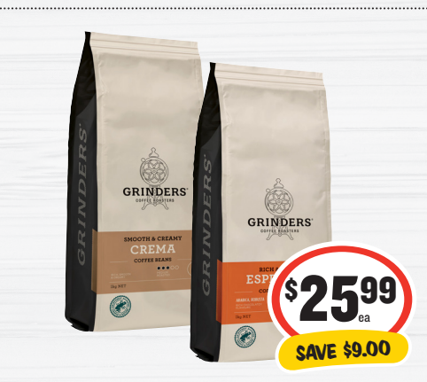
Grinders Coffee 1kg $2.60 per 100g