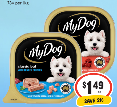
My Dog Tray 100g $1.49 per 100g