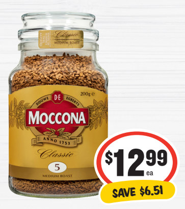
Moccona Classic/Premium Coffee 200g $6.50 per 100g