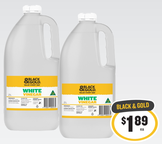
Black & Gold Vinegar White 2L