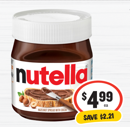
Nutella Hazelnut Spread 400g $1.25 per 100g