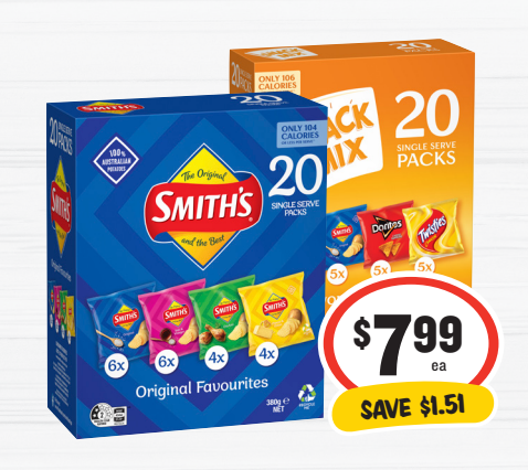
Smith's Potato Chips 18/20pk

Cottee's Cordial Syrup Double Concentrate 1L $4.99 per 1L