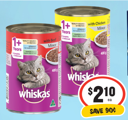
Whiskas Canned Cat Food 400g 53¢ per 100g