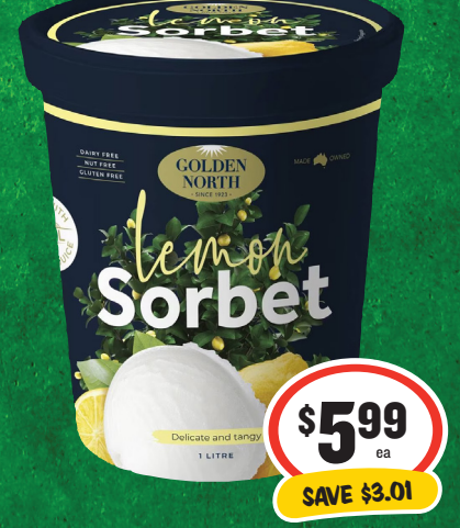
Golden North Sorbet 1L 60¢ per 100mL

Whilst stocks last. Some products or varieties may not be available at all stores. Pictures for illustration purposes only.