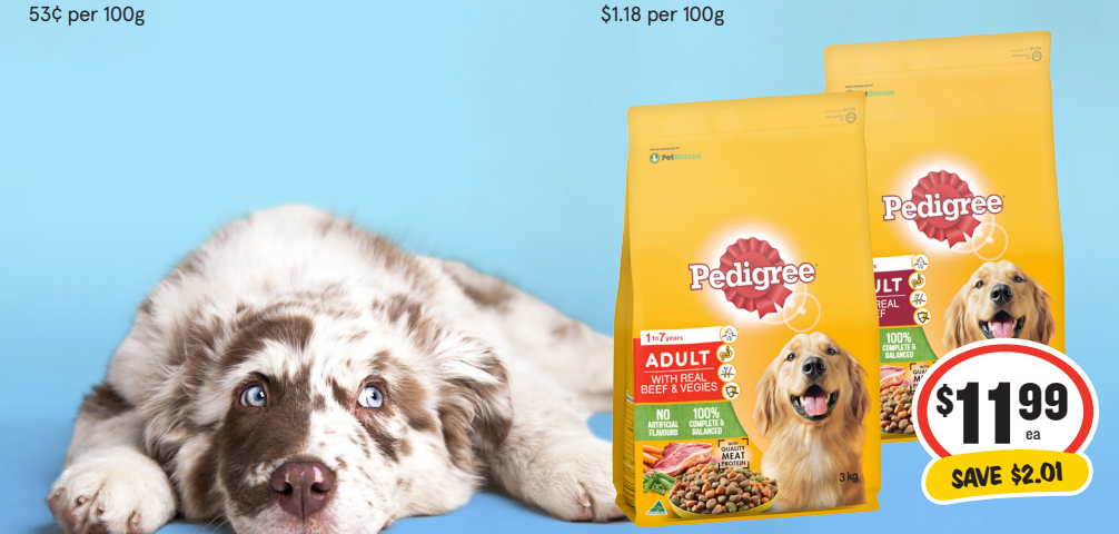
Pedigree Dry Dog Food 2.5/3kg