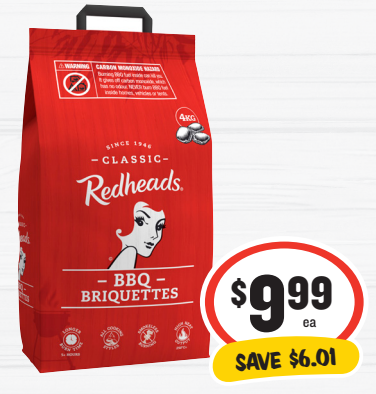
Redheads BBQ Briquettes 4kg 25¢ per 100g