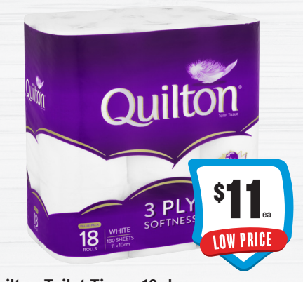
Quilton Toilet Tissue 18pk 34¢ per 100sh