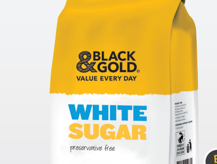
Black & Gold White Sugar 2kg 16¢ per 100g