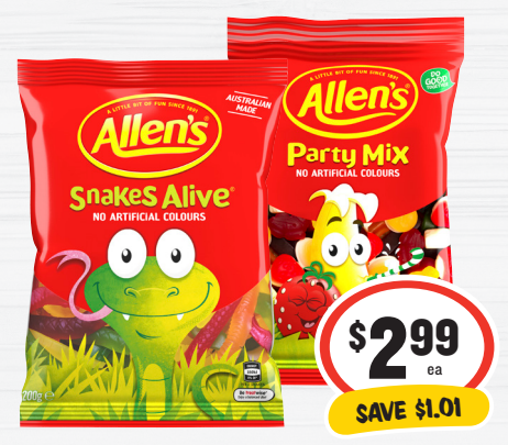
Allen's Jelly/Mint Confectionery Range 140-200g