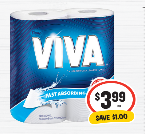
Kleenex Viva Paper Towel 2pk