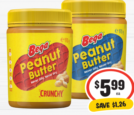
Bega Peanut Butter 470g $1.27 per 100g