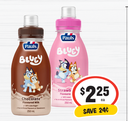
Pauls Bluey Flavoured Milk 250mL $9.00 per 1L