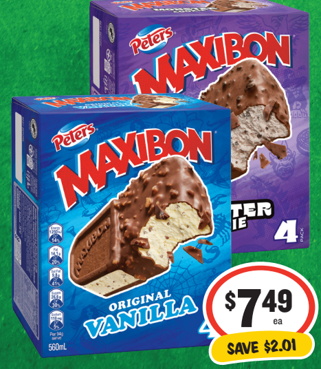
Peters Maxibon 4pk $1.34 per 100mL