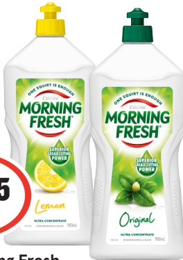
Morning Fresh Dishwashing Liquid 900mL 53¢ per 100mL