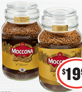
Moccona Freeze Dried Classic Coffee 400g $5.00 per 100g