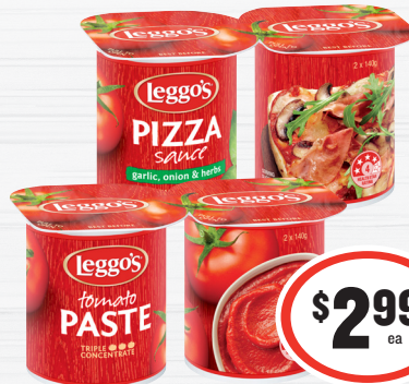
Leggo's Tomato Paste 2x140g $1.07 per 100g