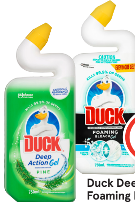
Duck Deep Action/Foaming Bleach 750mL 40¢ per 100mL