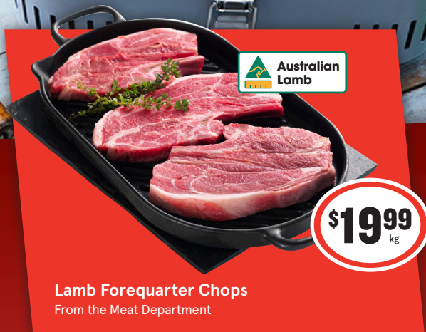
Lamb Forequarter Chops From the Meat Department