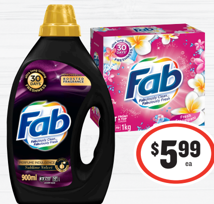
Fab Laundry Powder 1kg or Liquid 900mL