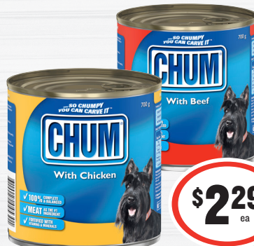
Chum Canned Dog Food 700g 33¢ per 100g