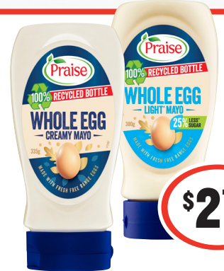
Praise Mayonnaise Whole Egg 335/380g