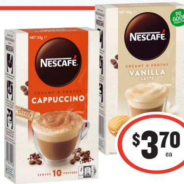
Nescafé Coffee Sachets 10pk/Gold 8pk