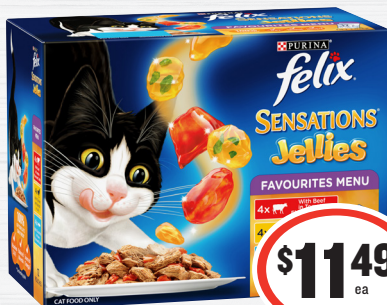
Felix Cat Food 12pk $1.13 per 100g