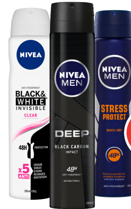
Nivea Aerosol Deodorant 250mL $1.50 per 100mL