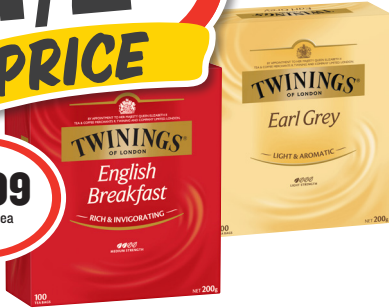
Twinings Teabags 80/100s