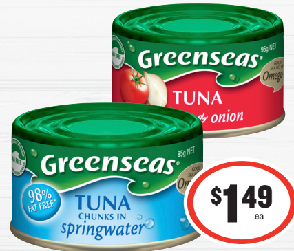
Greenseas Canned Tuna 95g $15.68 per 1kg